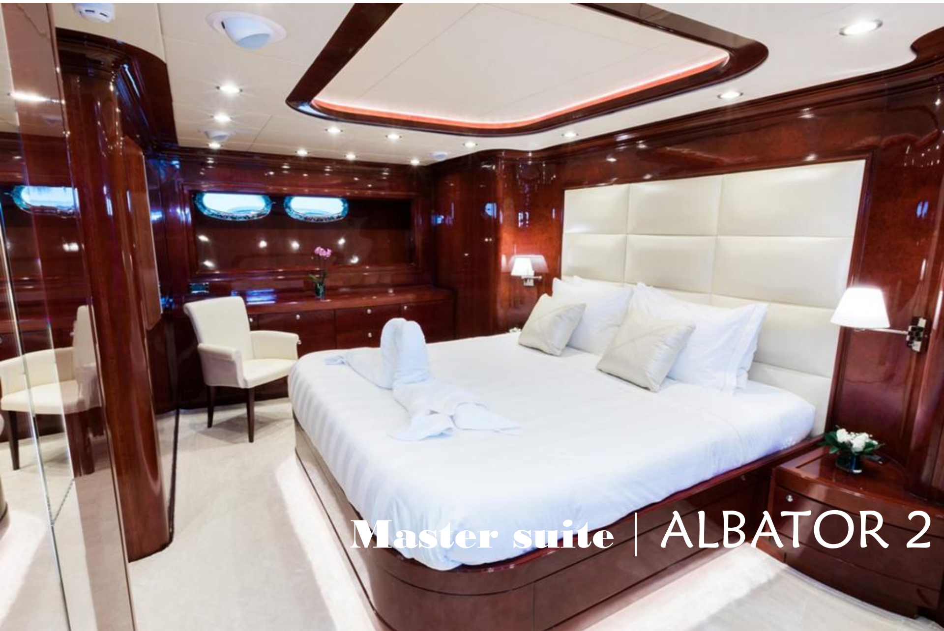
Master suite | ALBATOR 2