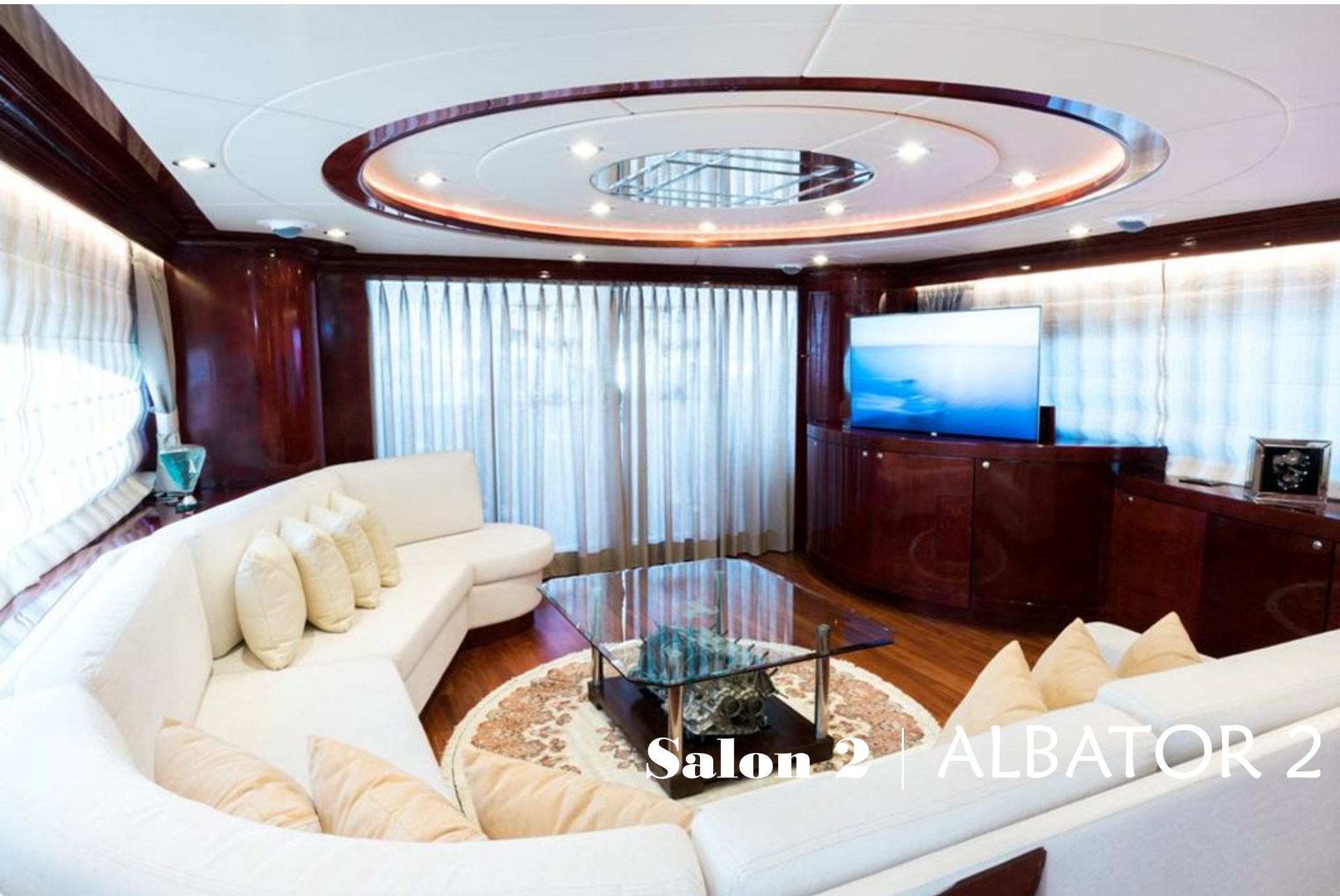
Salon 2 | ALBATOR 2