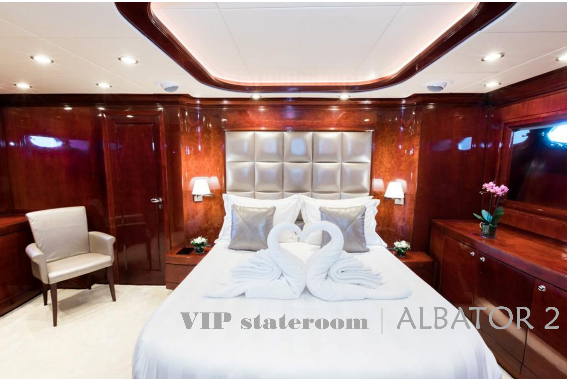
VIP stateroom | ALBATOUR 2