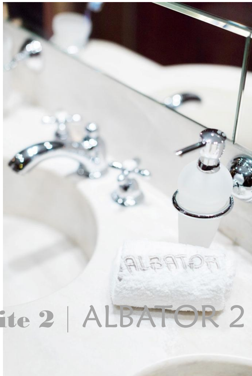
Master en suite 2 | ALBATOR 2