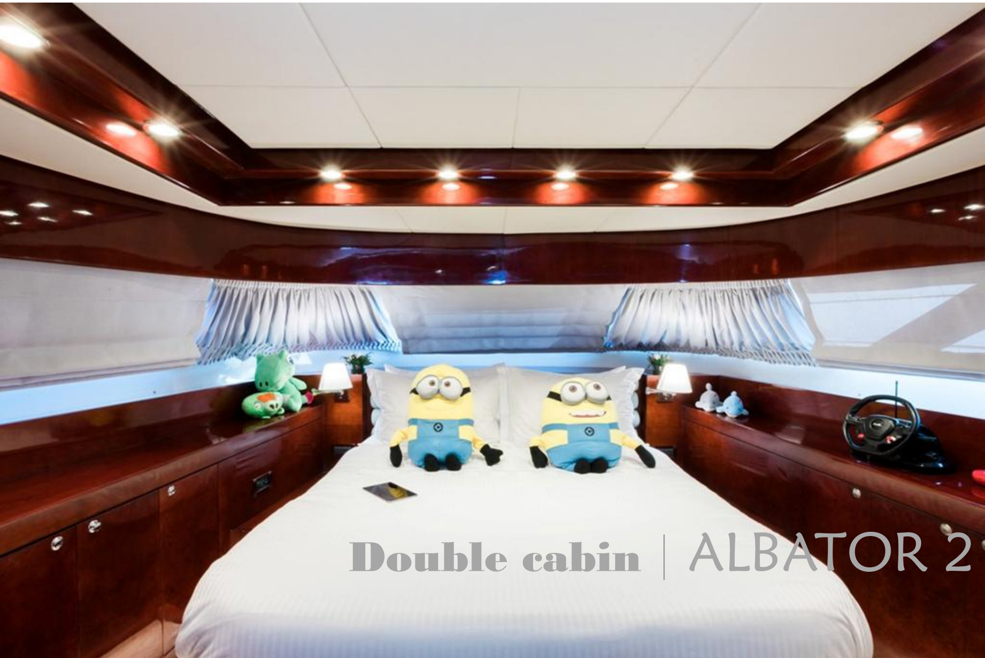
Double cabin | ALBATOR 2