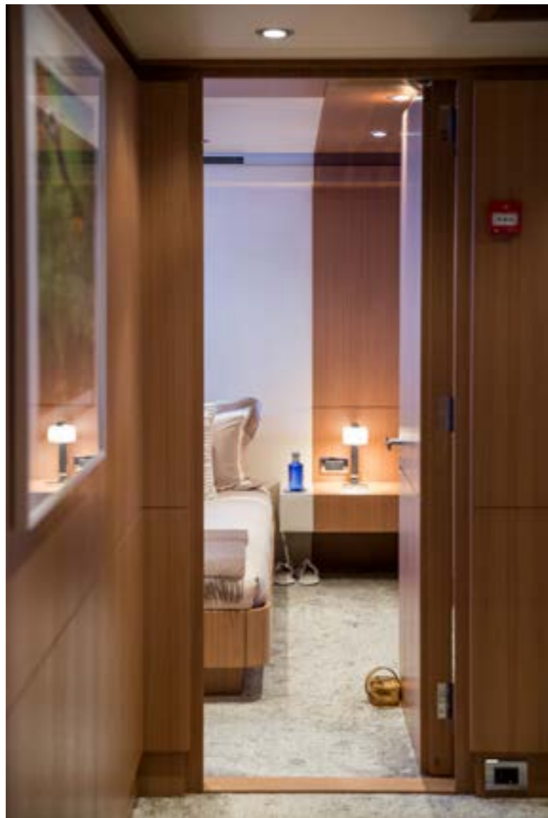
LOWER DECK GUEST VIP CABIN