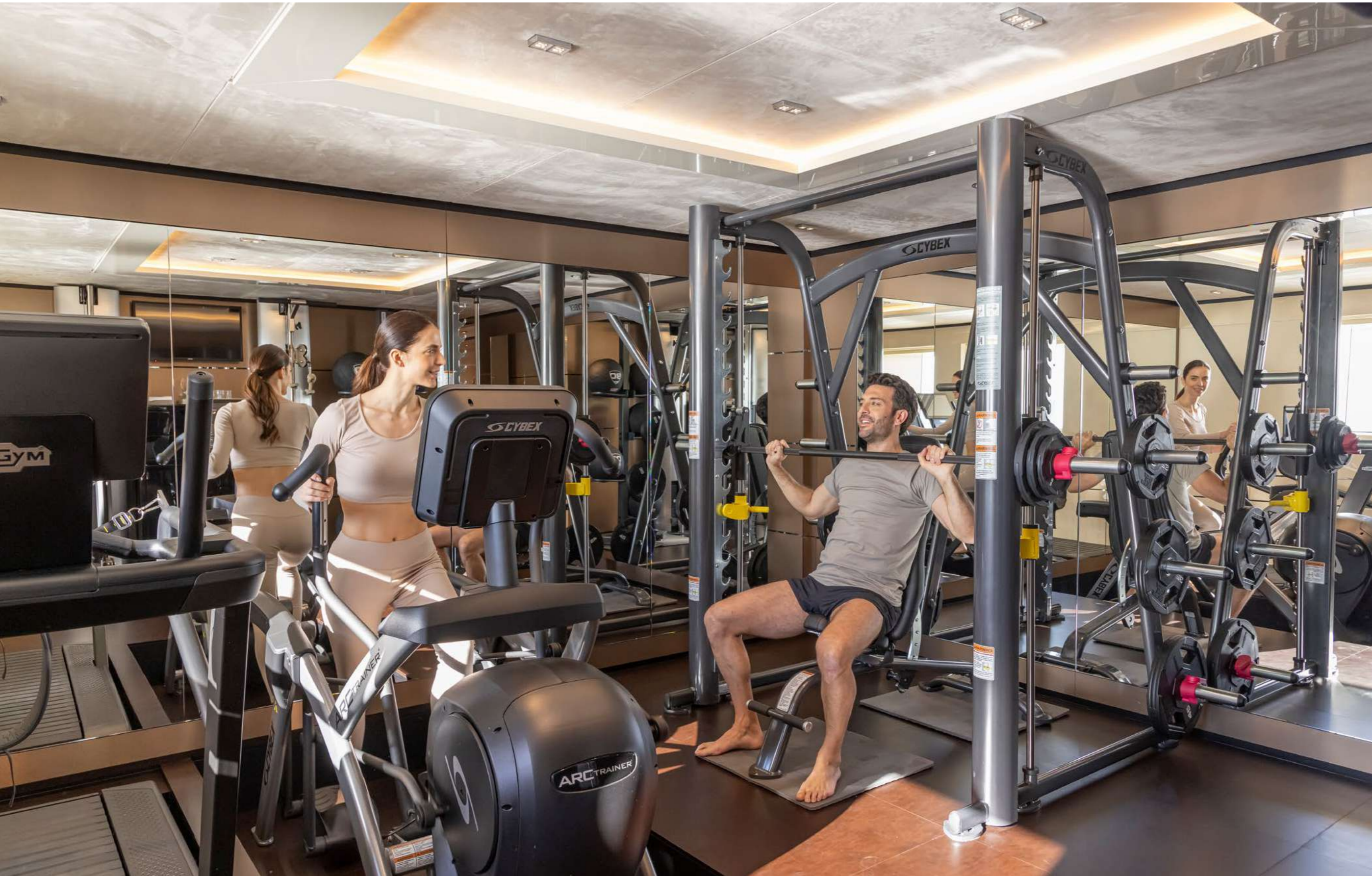
Fully equipped gym at the main deck | Gym Equipment: Treadmill, Elliptical, Pulley, Mats, Free weight, Bench