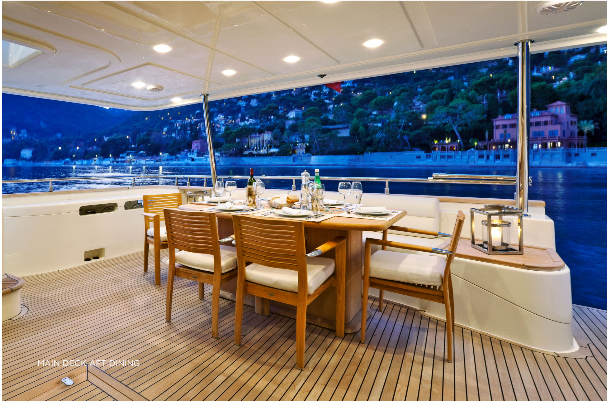
MAIN DECK AFT DINING