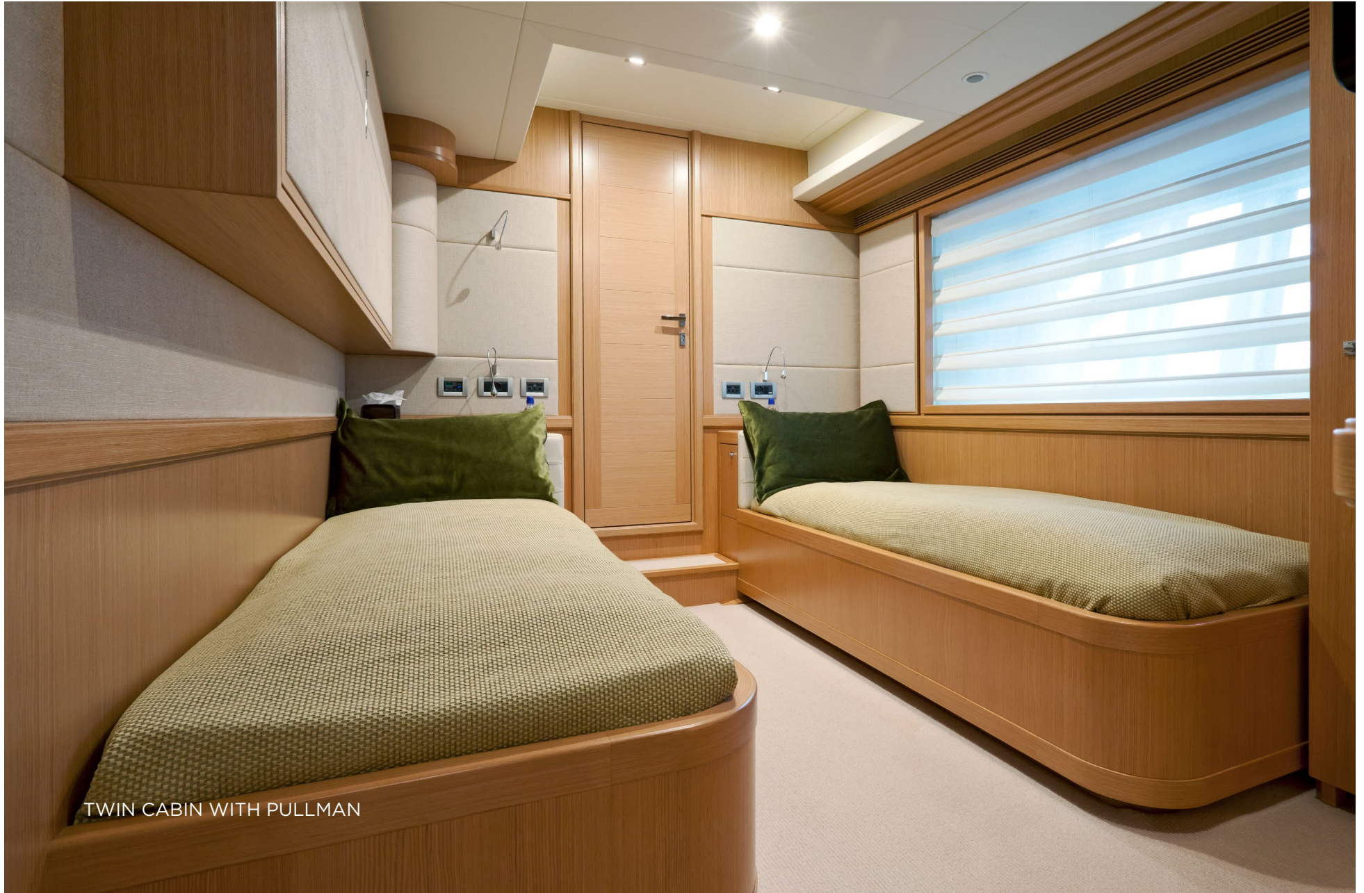
TWIN CABIN WITH PULLMAN