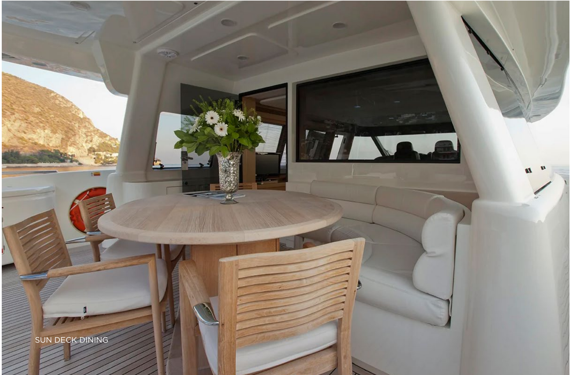
SUN DECK DINING