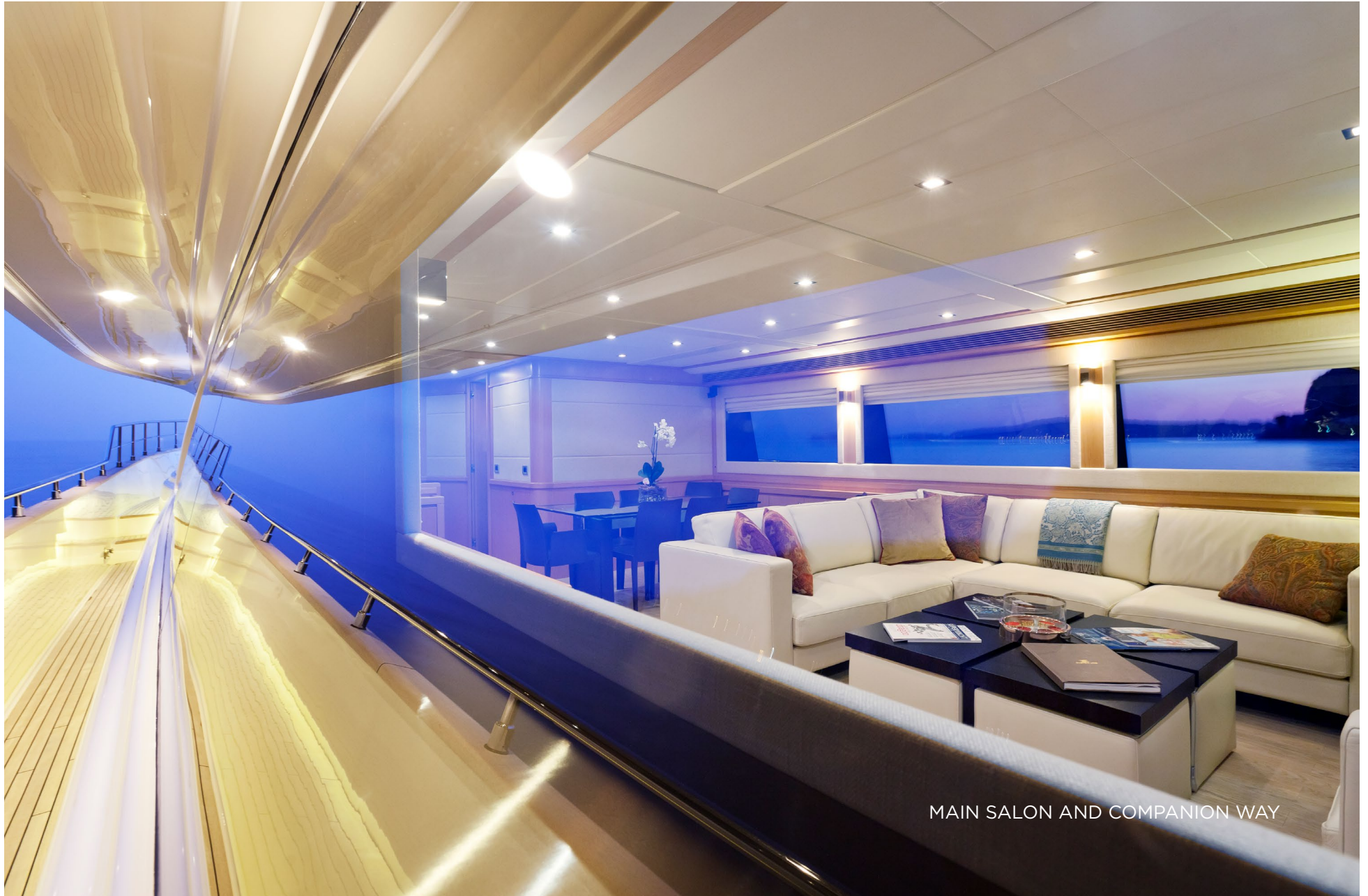
MAIN SALON AND COMPANION WAY