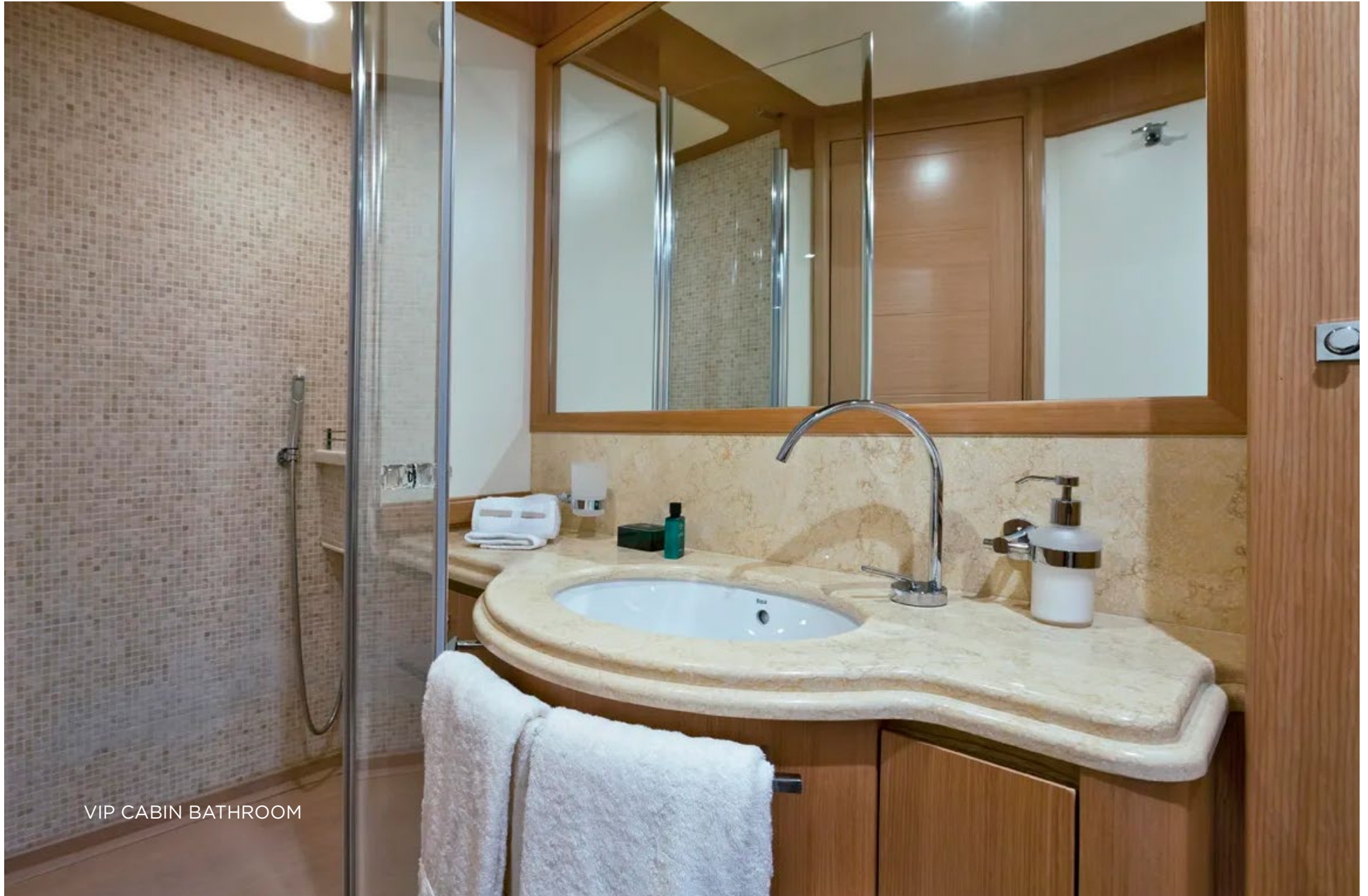
VIP CABIN BATHROOM