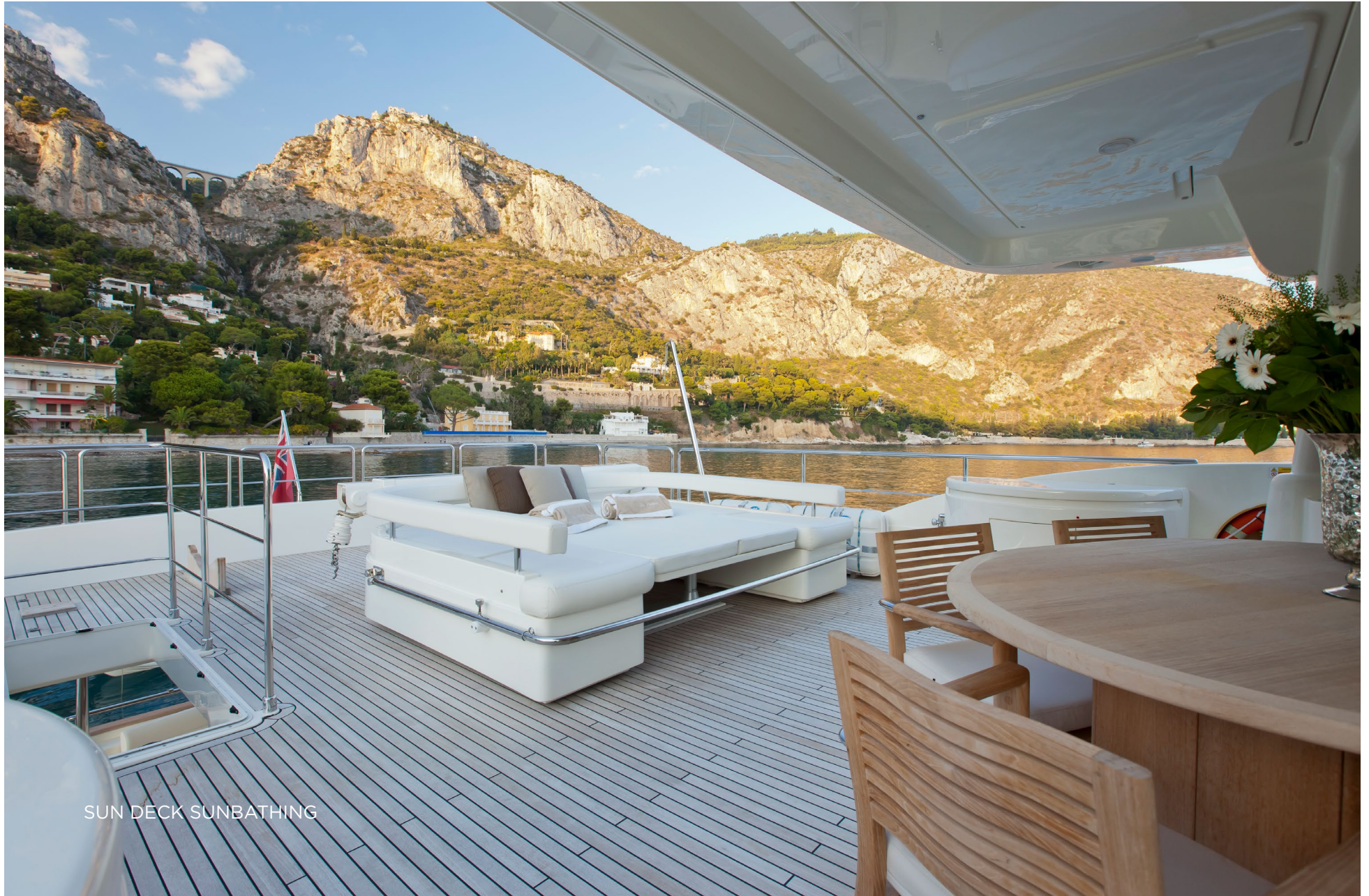
SUN DECK SUNBATHING