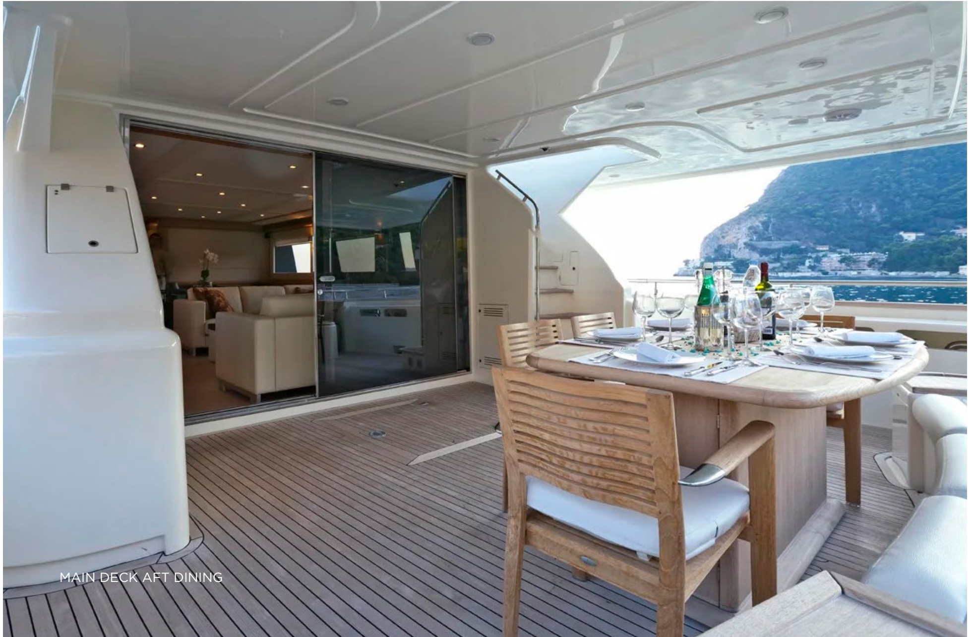
MAIN DECK AFT DINING