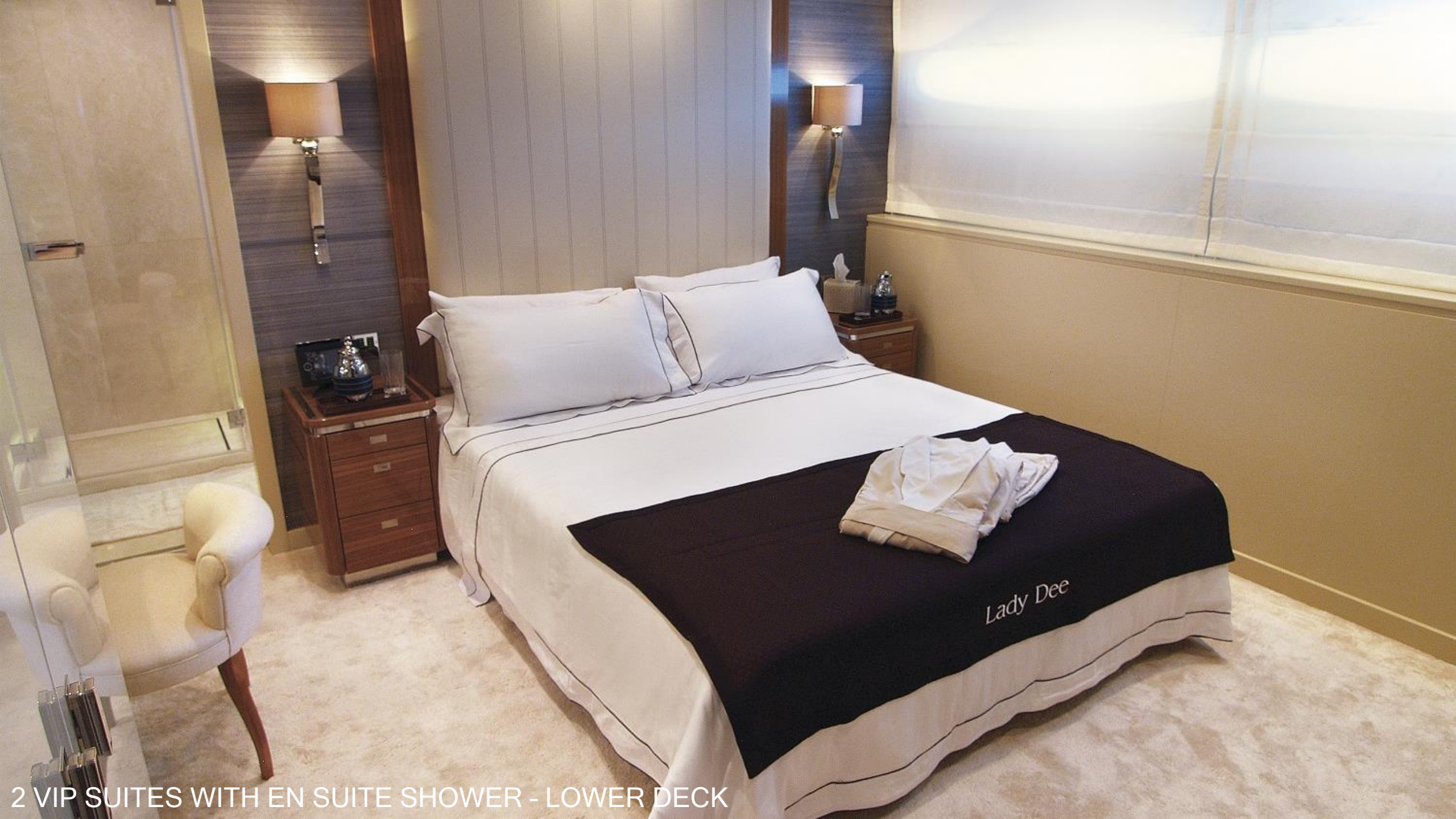
2 VIP SUITES WITH EN SUITE SHOWER - LOWER DECK