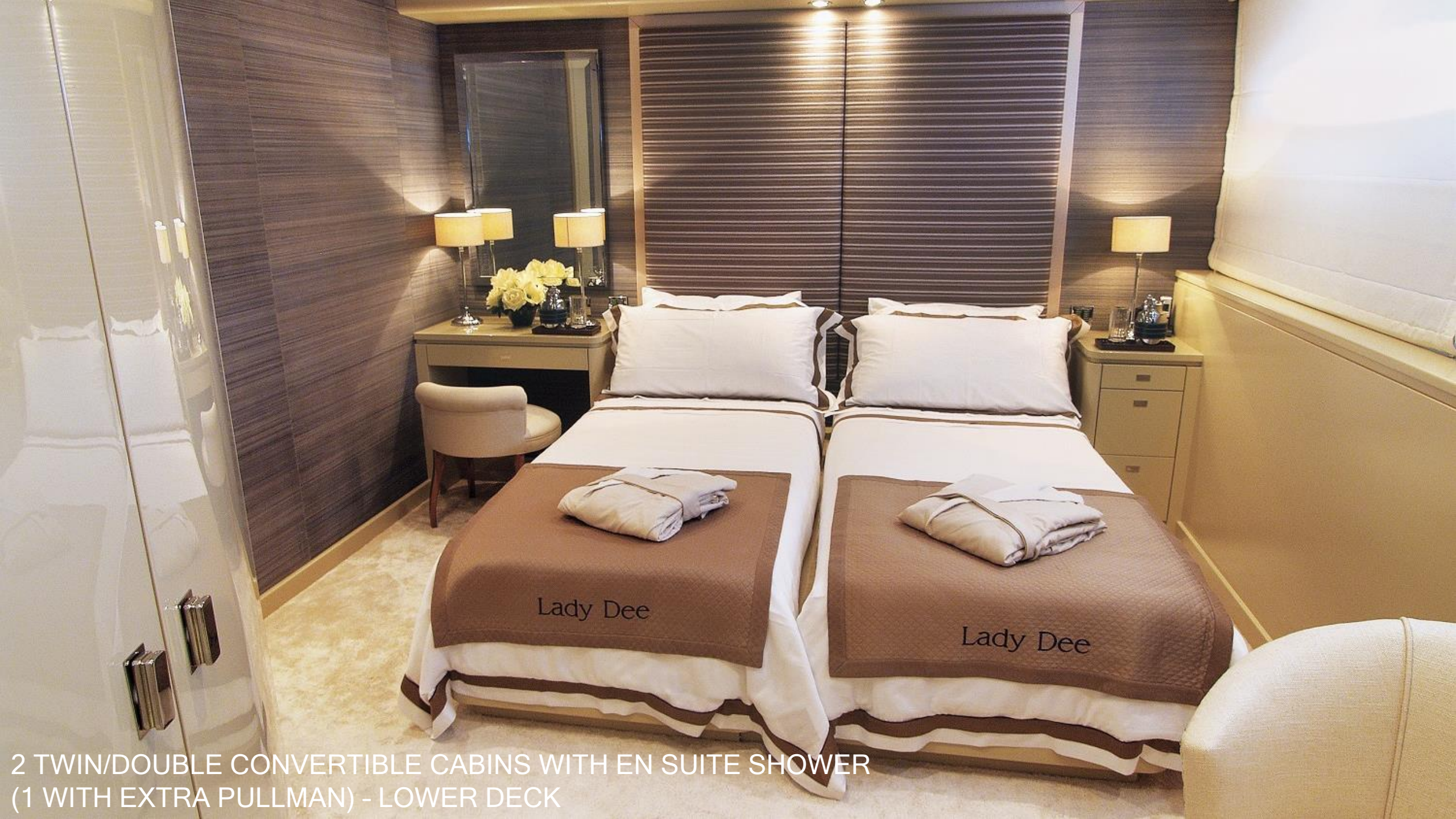
2 TWIN/DOUBLE CONVERTIBLE CABINS WITH EN SUITE SHOWER (1 WITH EXTRA PULLMAN) - LOWER DECK