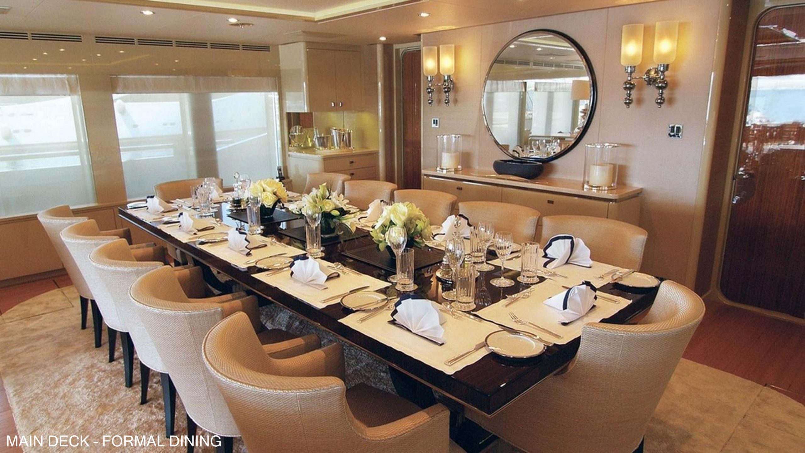
MAIN DECK - FORMAL DINING