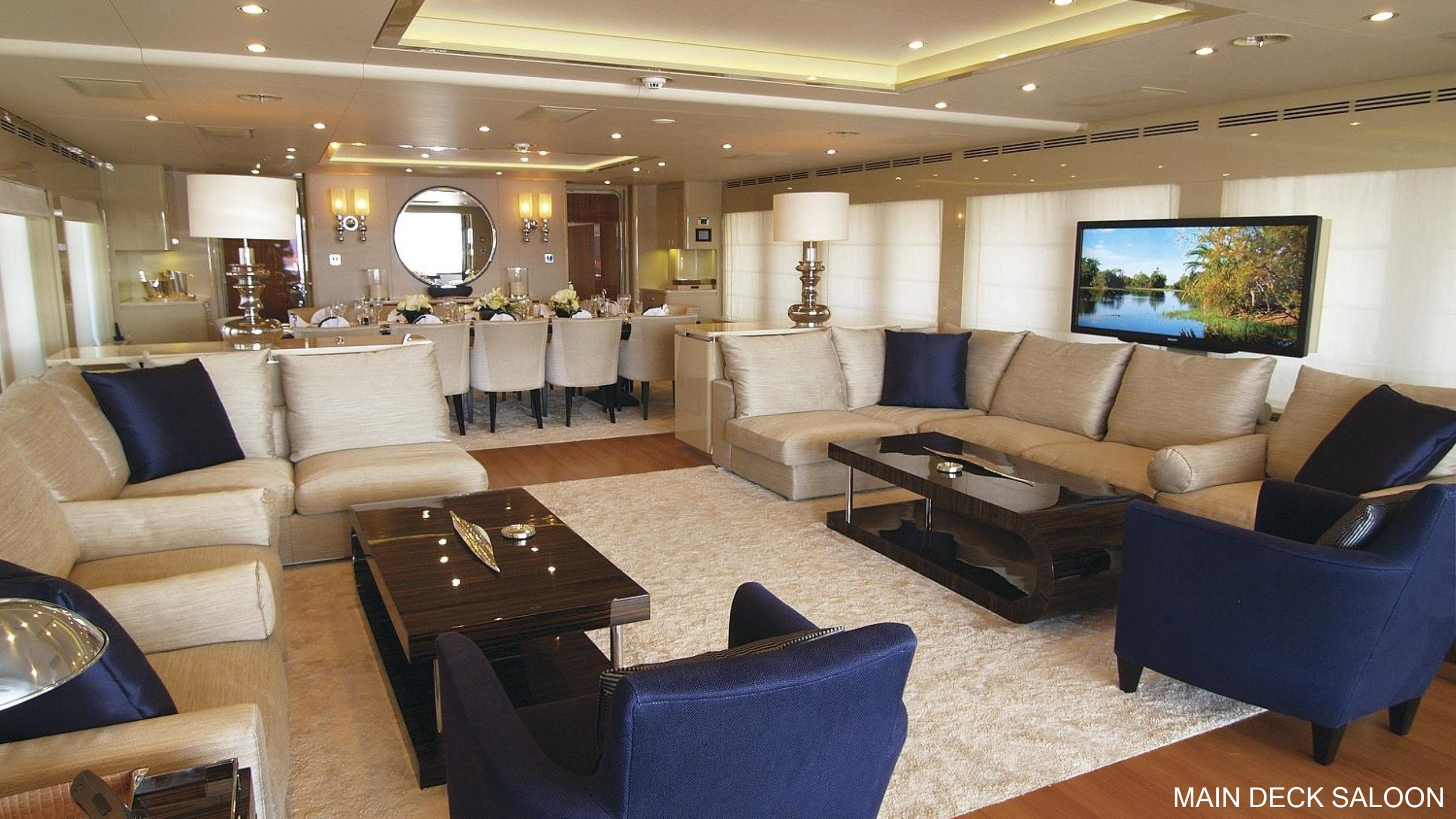
MAIN DECK SALOON