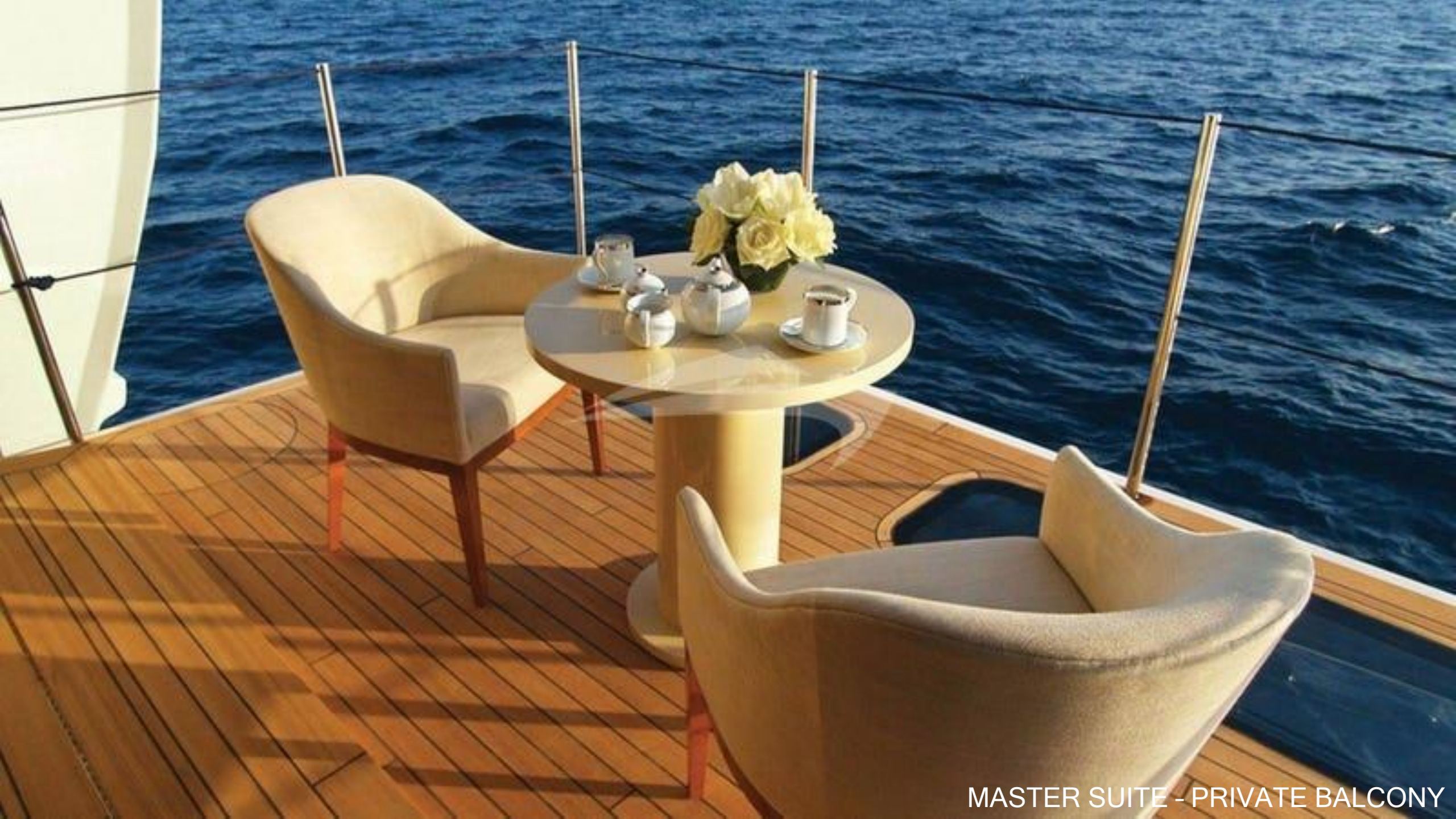
MASTER SUITE - PRIVATE BALCONY