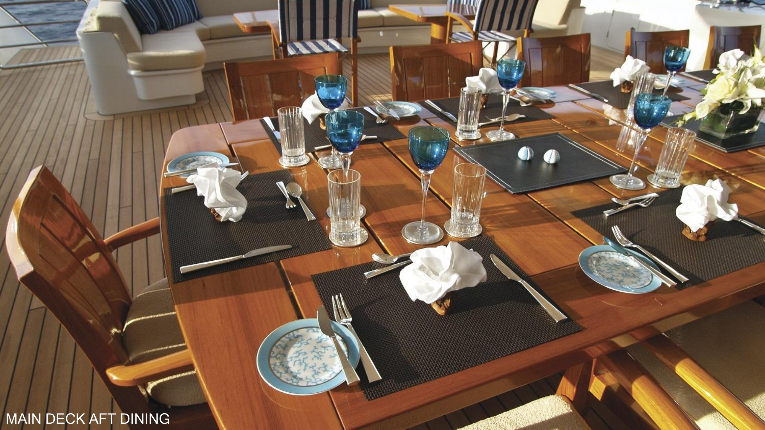
MAIN DECK AFT DINING