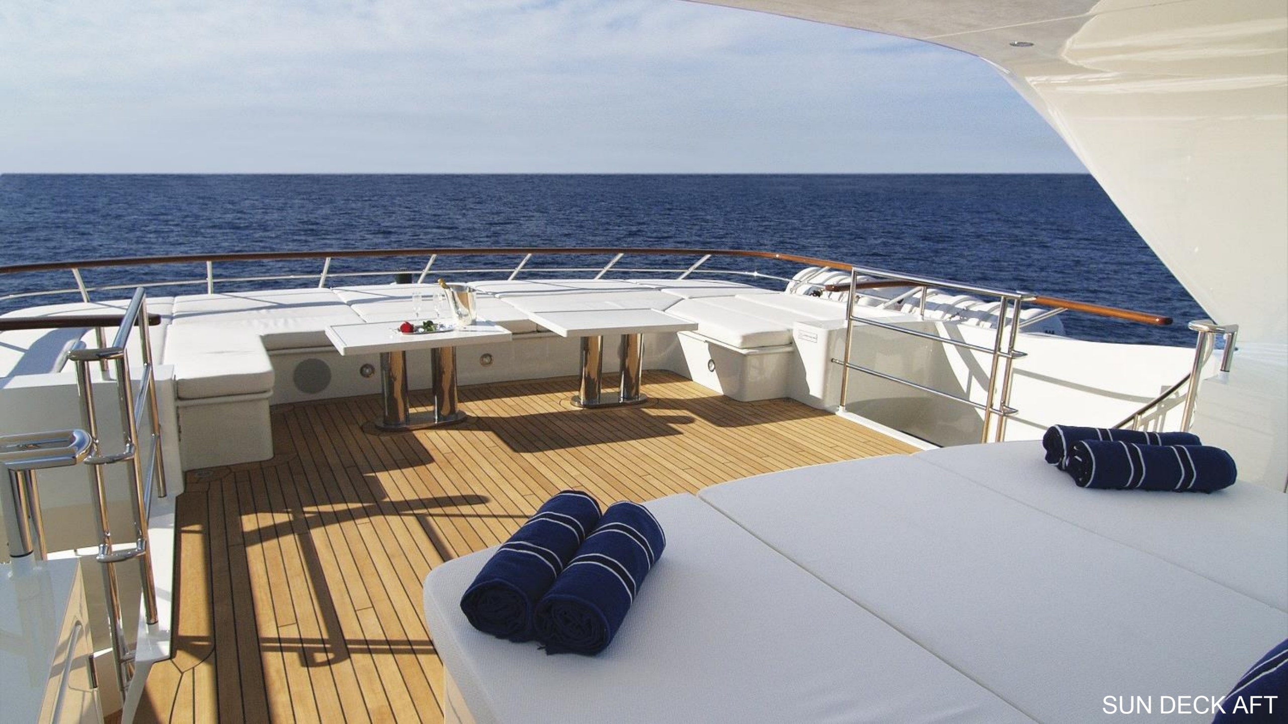
SUN DECK AFT