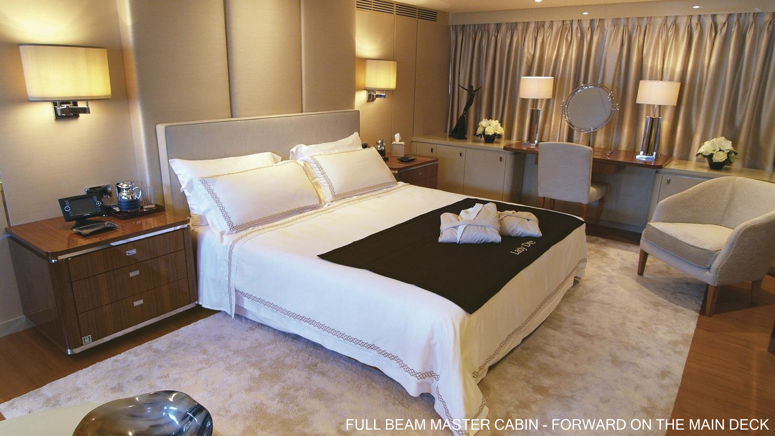
FULL BEAM MASTER CABIN - FORWARD ON THE MAIN DECK