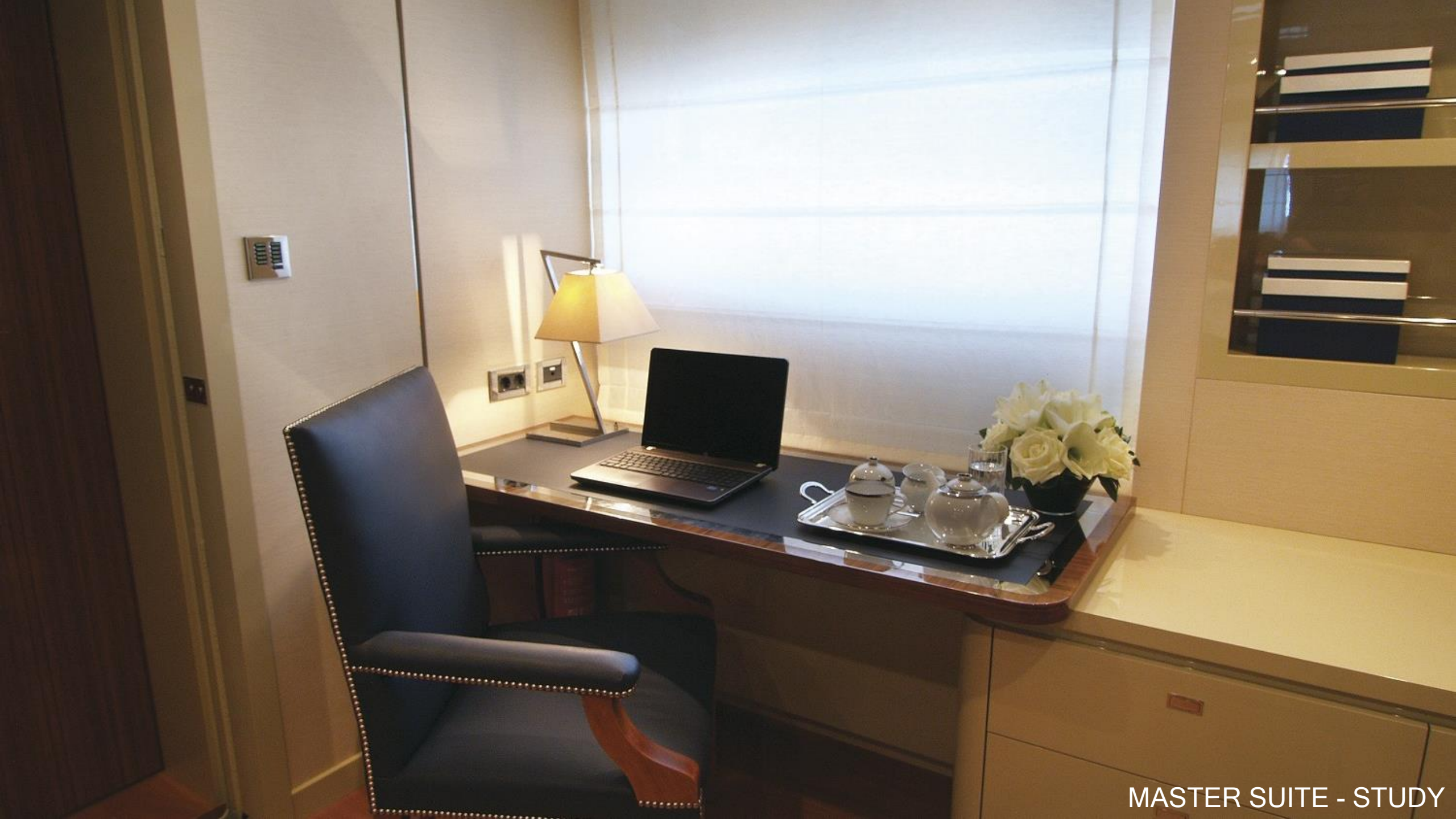
MASTER SUITE - STUDY