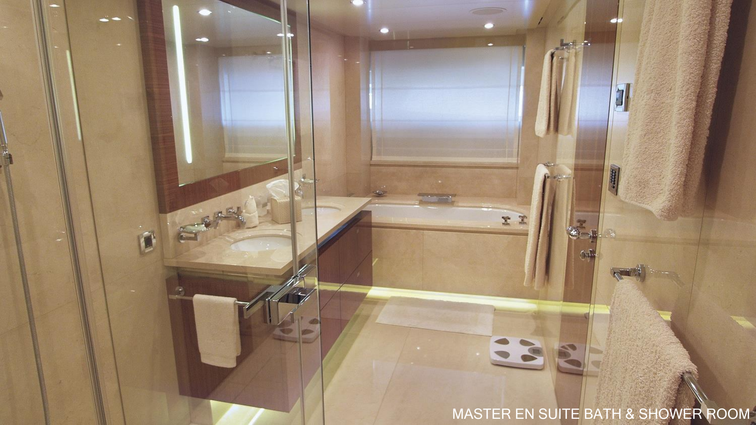
MASTER EN SUITE BATH & SHOWER ROOM