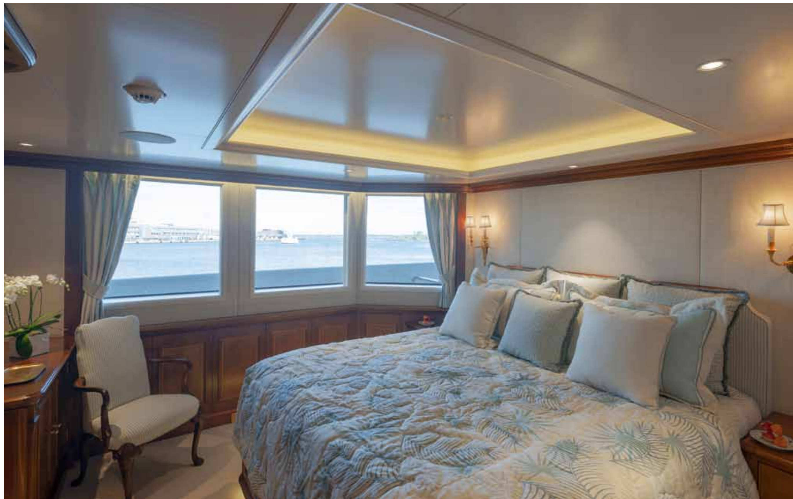
Four guest cabins are located on the lower deck and a fifth VIP suite is situated on the bridge deck. This suite is similar in the maritime décor to the lower deck cabins but has the advantage of large windows looking out over the side decks making this a particularly light and bright space.