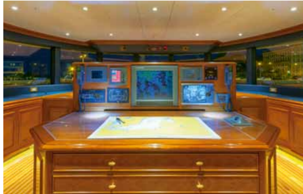
Lady Kathryn V, a yacht to make you feel at home, not only for her owners but also for charter guests who want to enjoy only the very best yachting has to offer.