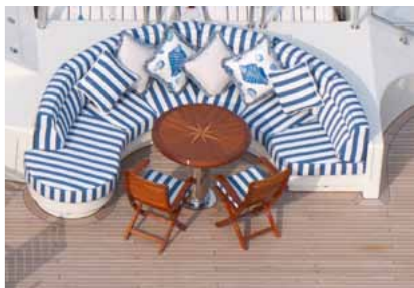
Lady Kathryn V has a length of 61m is probably the most voluminous yacht of her size. Her exterior design by Espen Oeino is dominated by sleek, curved features which have been extended throughout the whole yacht. The aft sun deck offers an airy place for enjoying breakfast, lunch or dinner. Together with the bar, the casual seatings and sun beds it is the most popular area onboard.