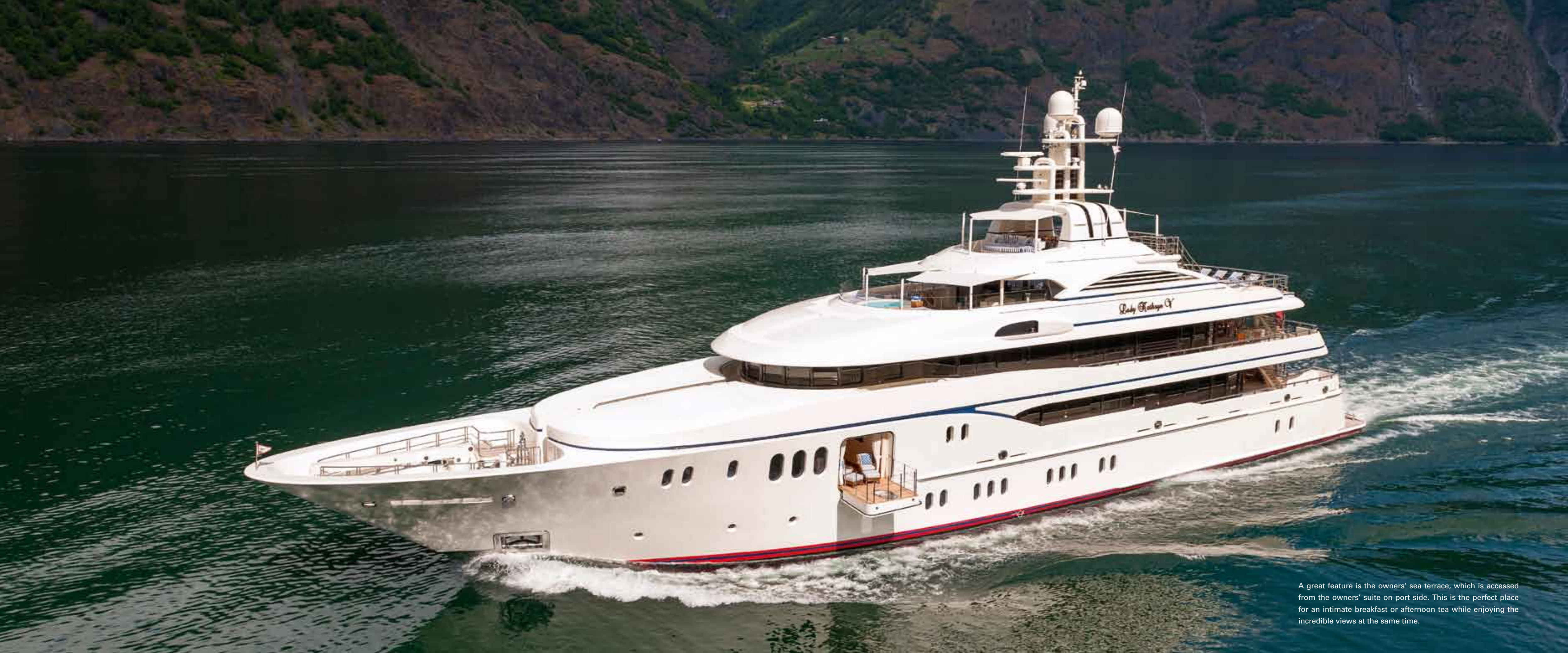
A great feature is the owners' sea terrace, which is accessed from the owners' suite on port side. This is the perfect place for an intimate breakfast or afternoon tea while enjoying the incredible views at the same time.