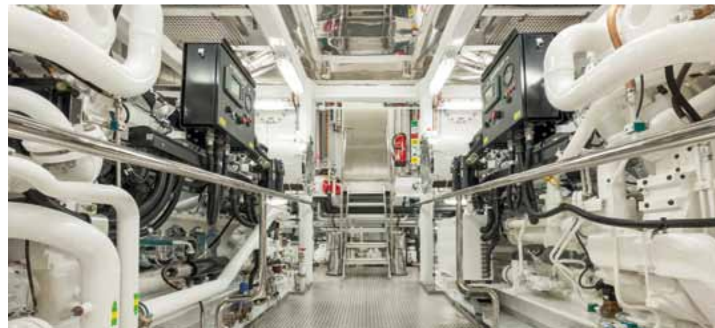
Lady Kathryn V is powered by two Caterpillar engines of 1,455 kW each and reaches a top speed of 15.5 knots and has a range of 7,000 nm. Advanced sound and vibration-reduction features guarantee an extremely quiet running yacht. She is of course fitted with zero speed stabilizers and lies very comfortably on the water.