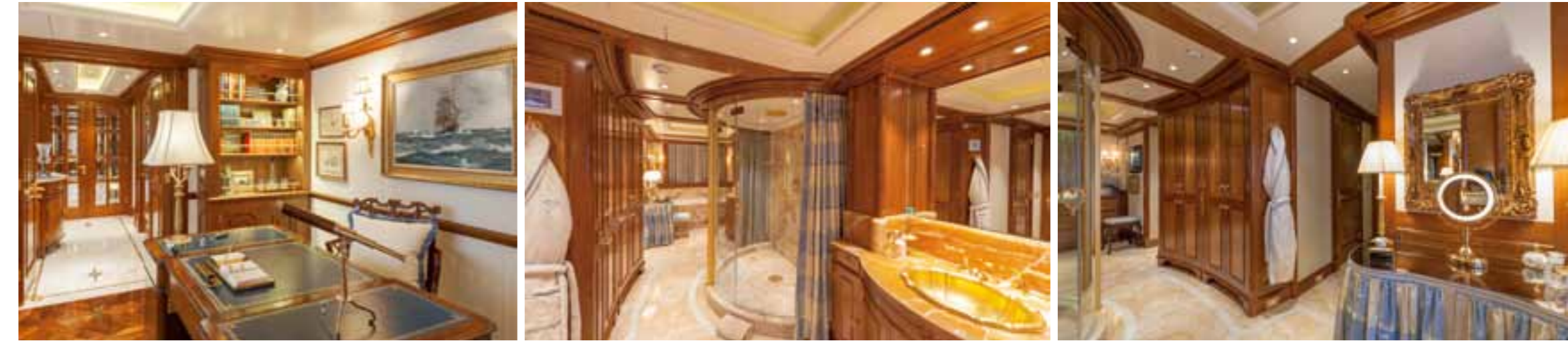
A private study leads to the owners' private salon. Huge windows are maximising the light and views. The owners' cabin itself is to port and forward of it are his and her dressing rooms and water closets which lead to the full-beam bathroom which can be closed-off on centreline if desired for complete privacy.