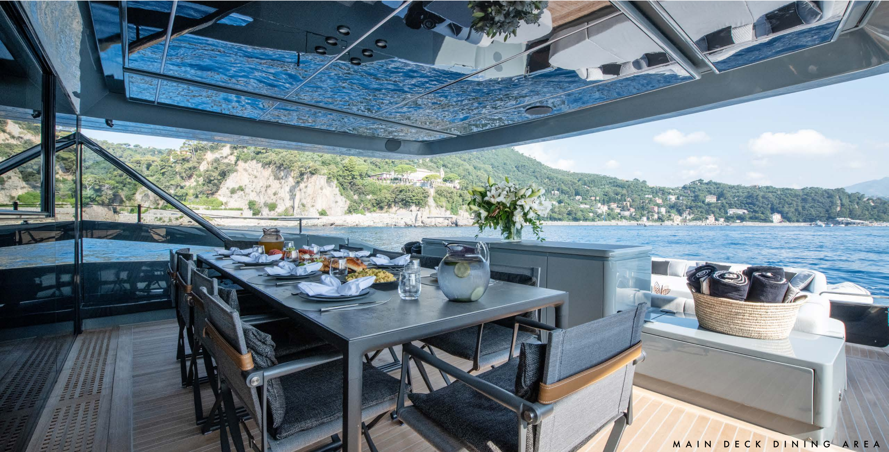
M A I N D E C K D I N I N G A R E A