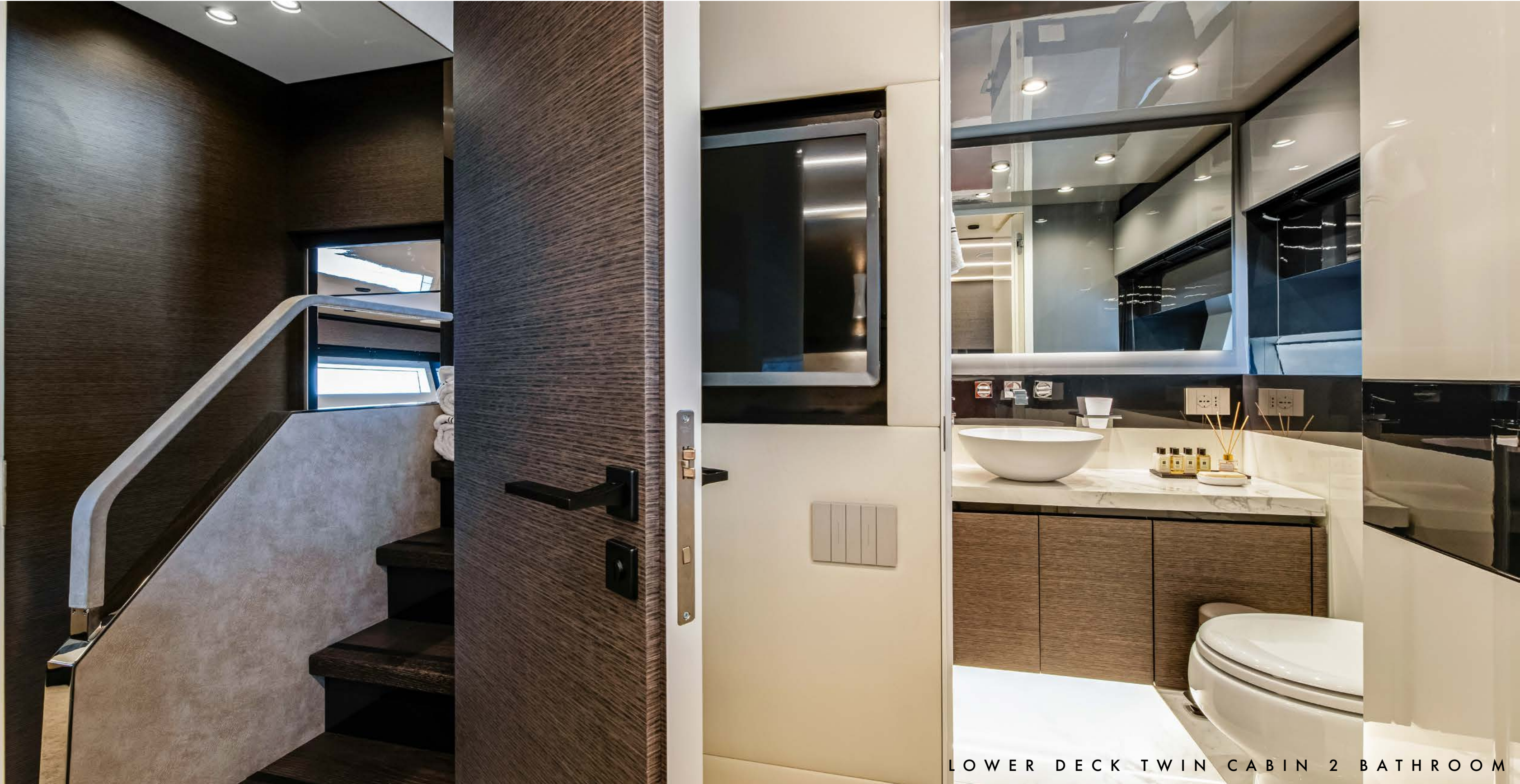
LOWER DECK TWIN CABIN 2 BATHROOM