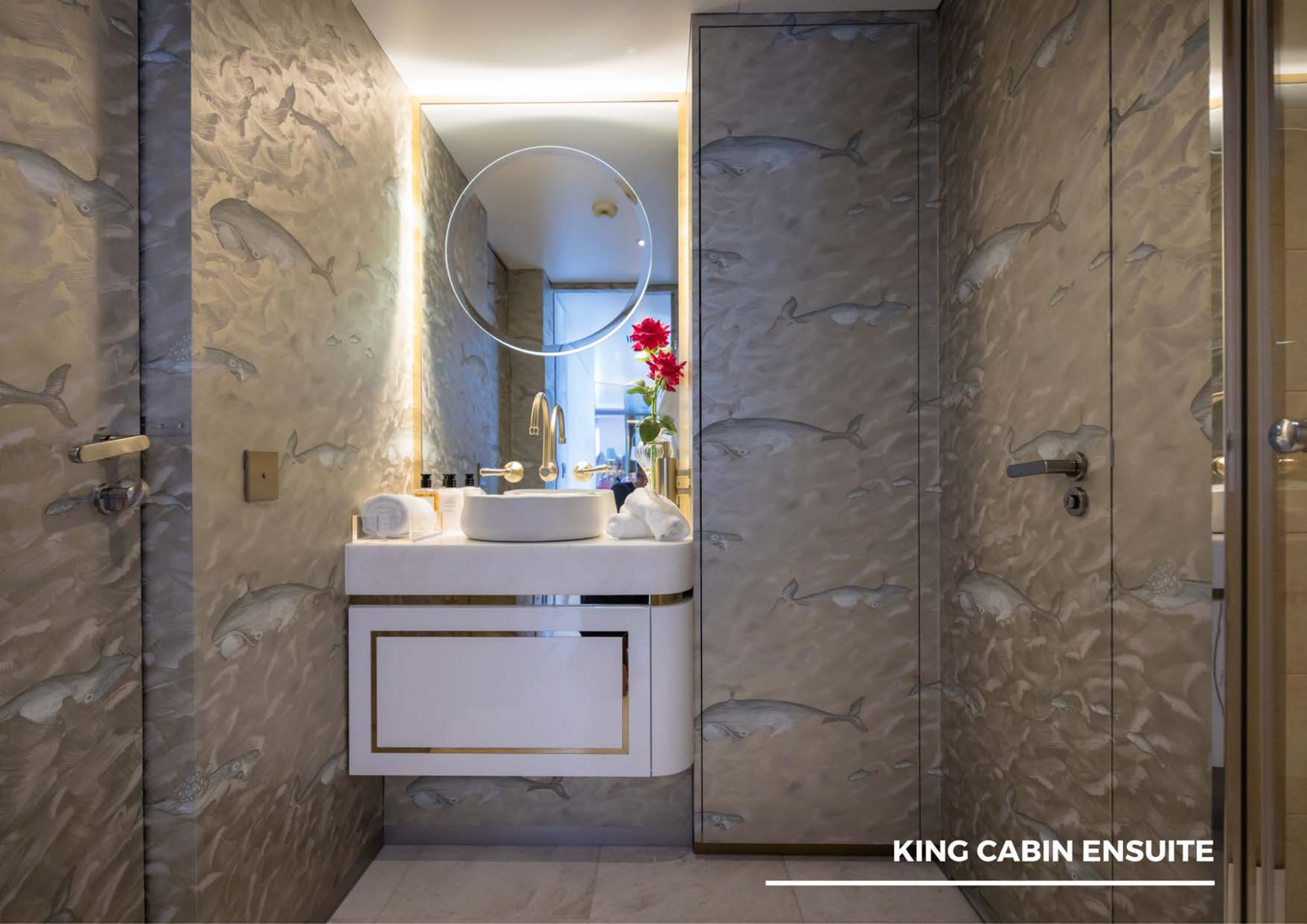
KING CABIN ENSUITE