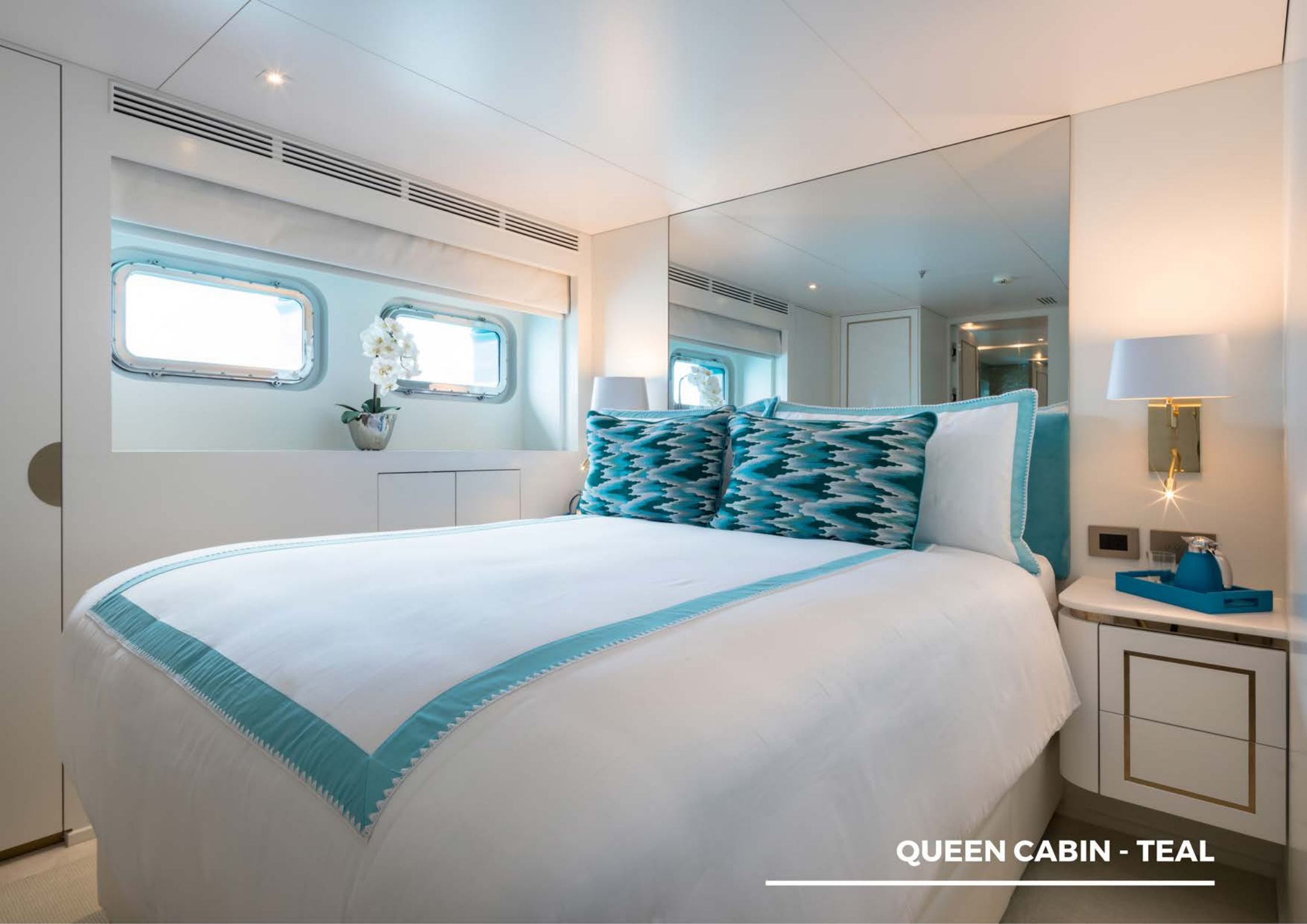
QUEEN CABIN - TEAL