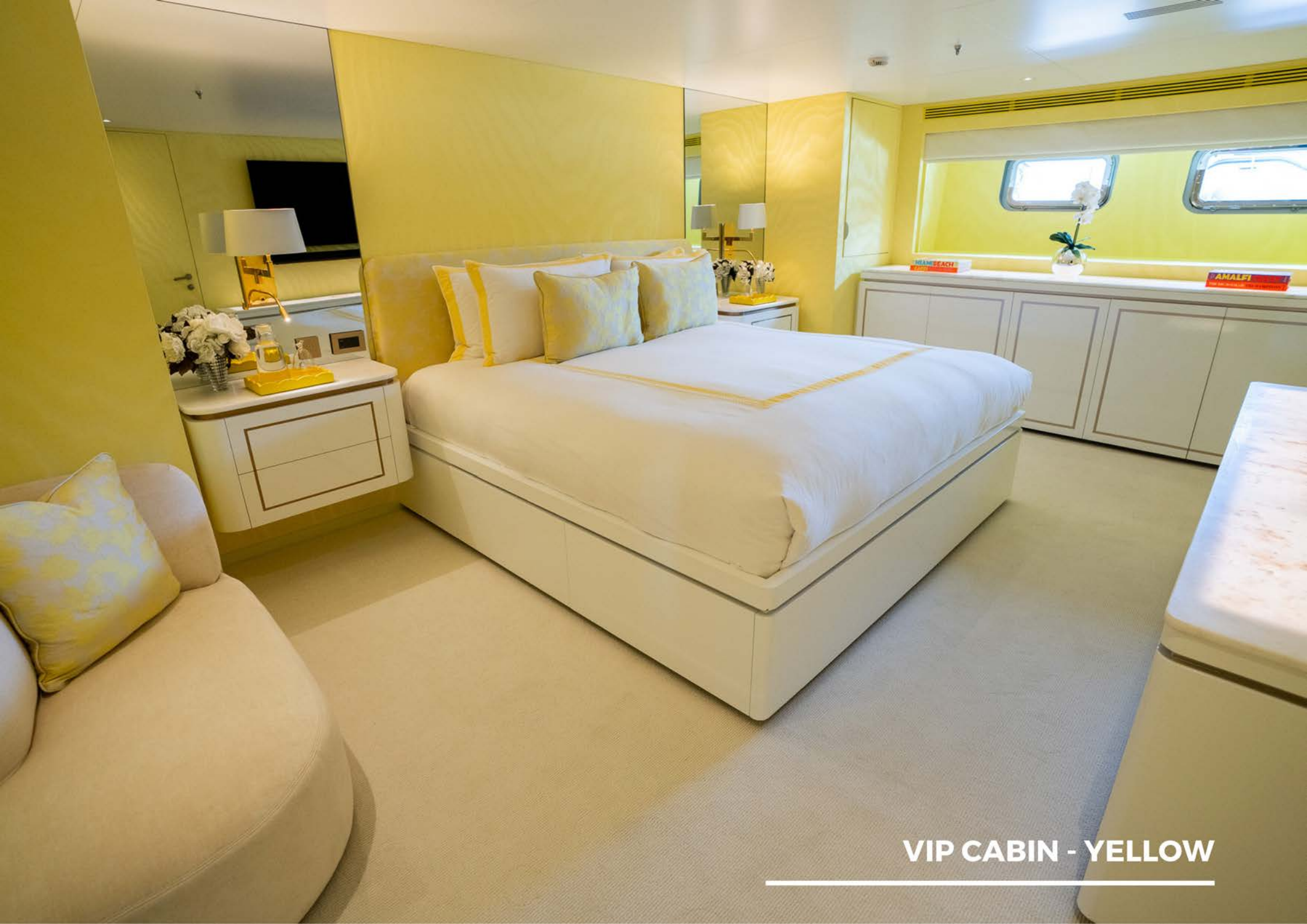
VIP CABIN - YELLOW