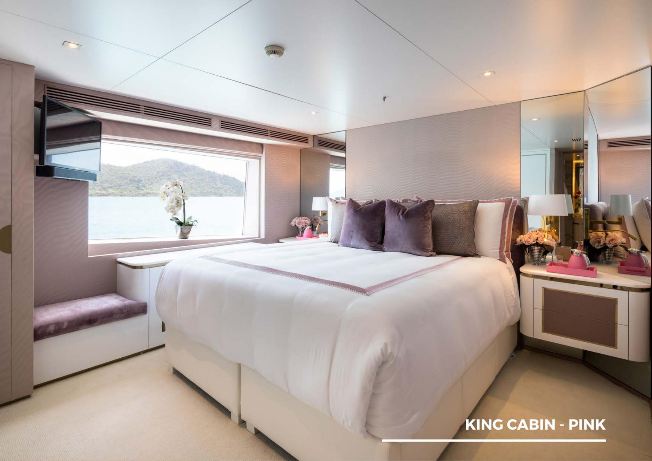
KING CABIN - PINK