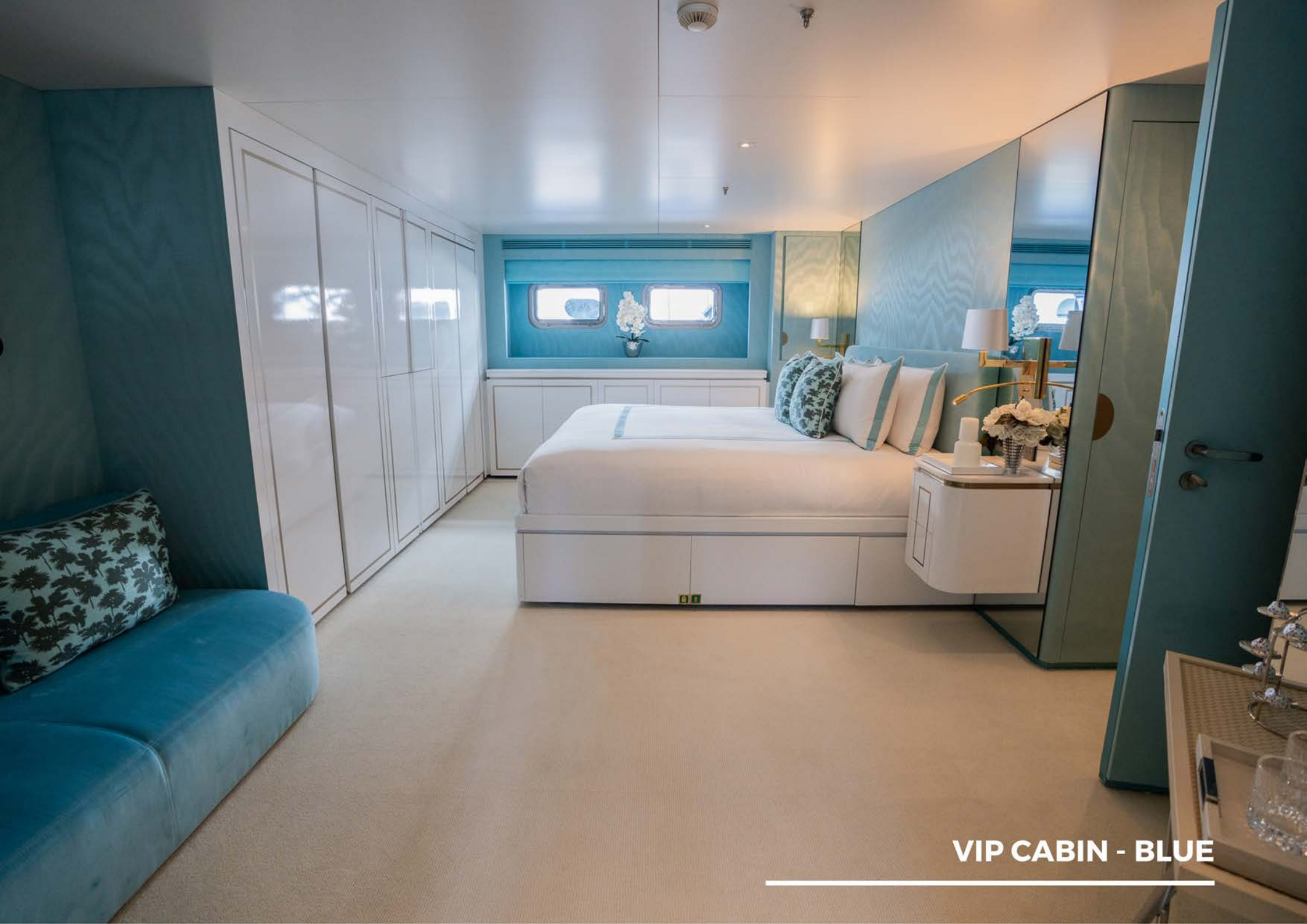
VIP CABIN - BLUE