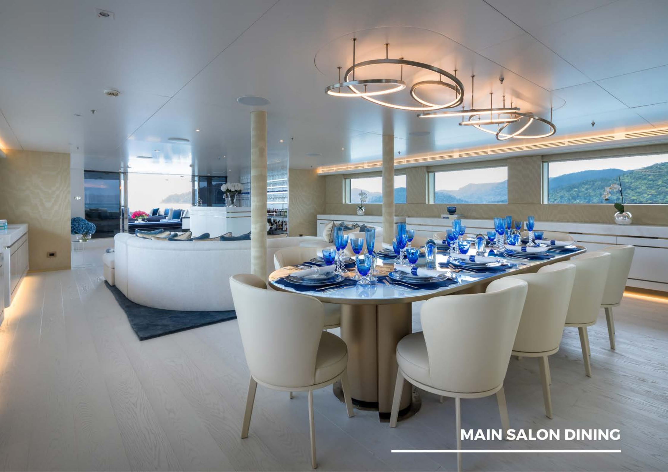
MAIN SALON DINING