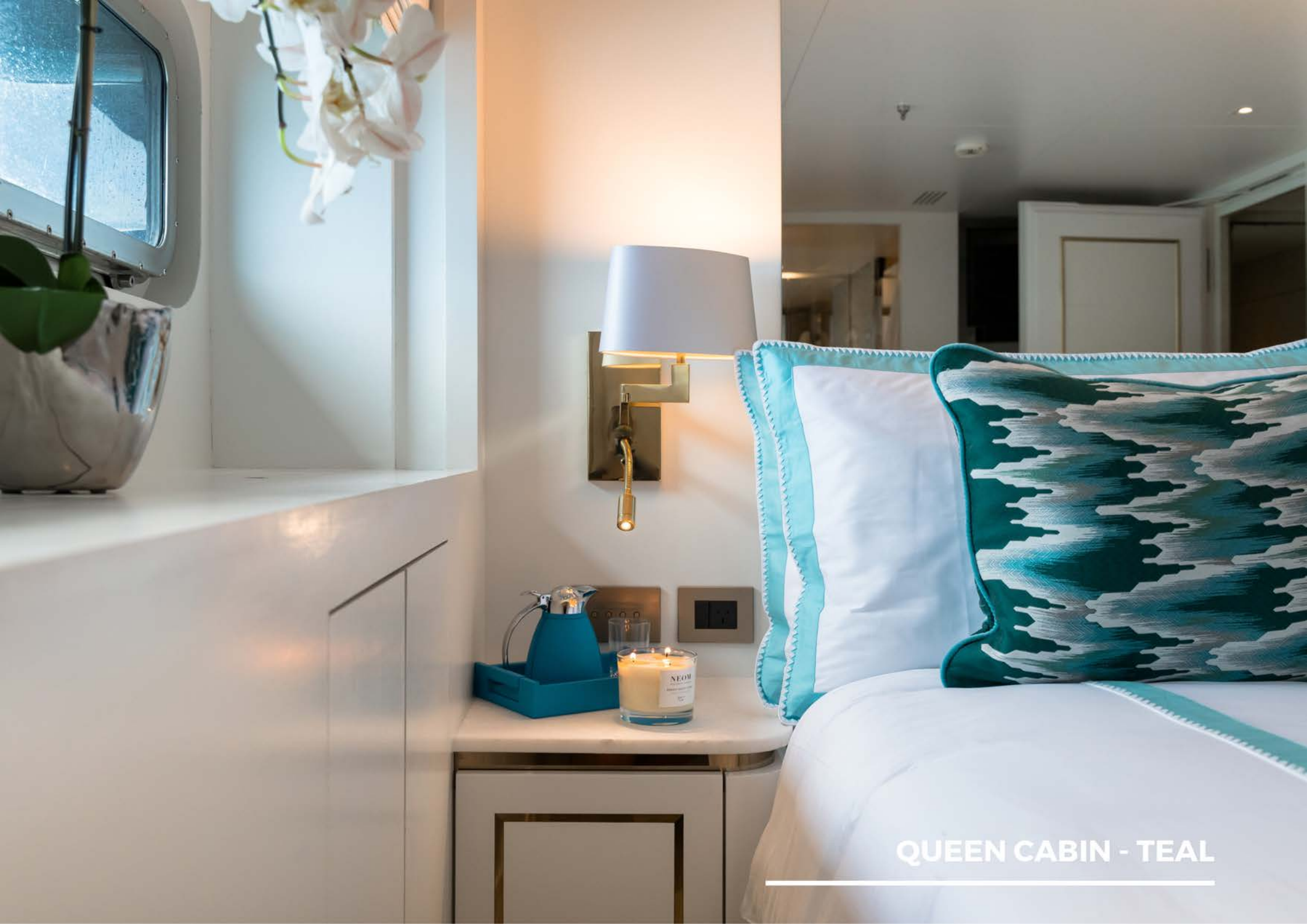
QUEEN CABIN - TEAL