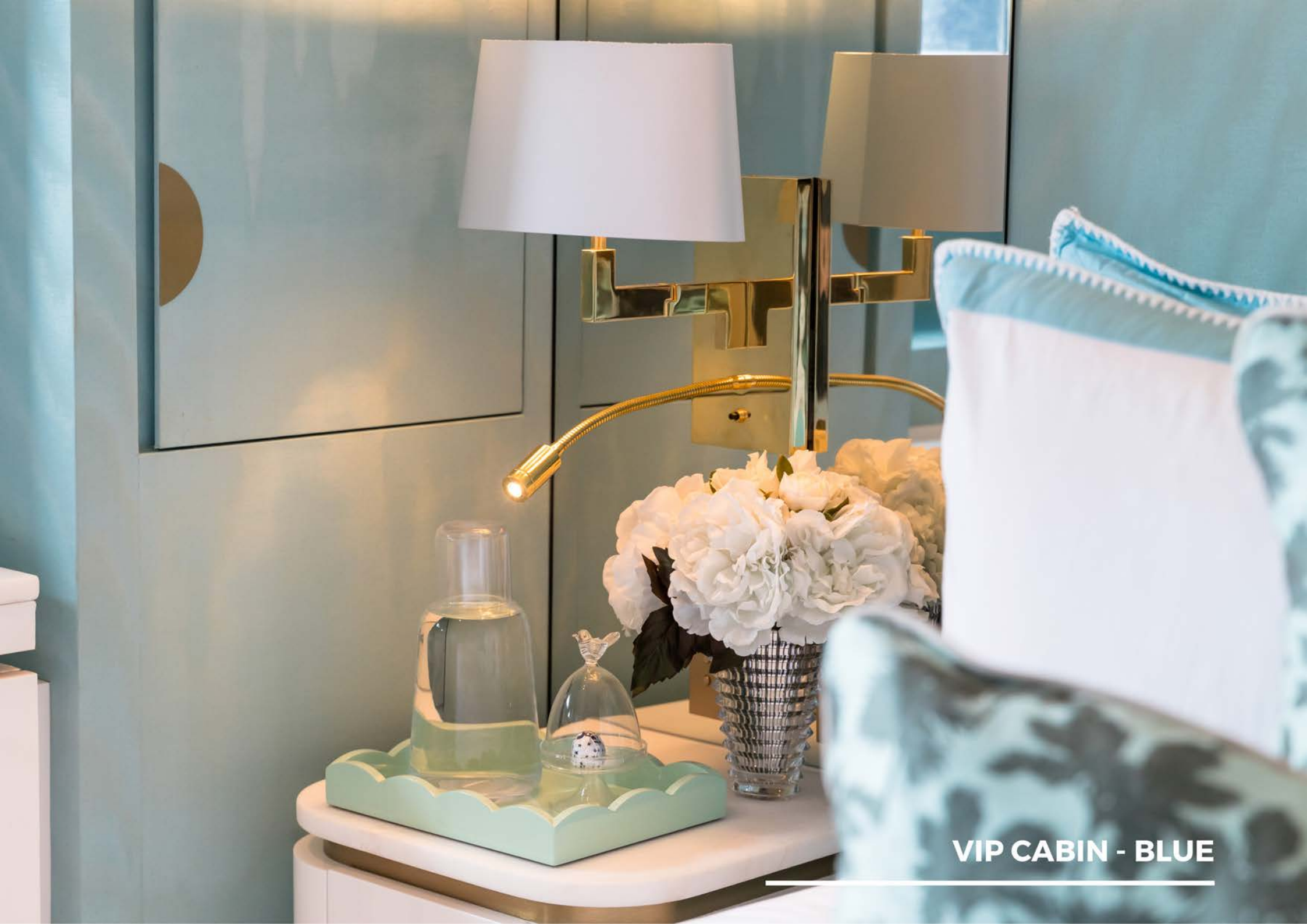
VIP CABIN - BLUE