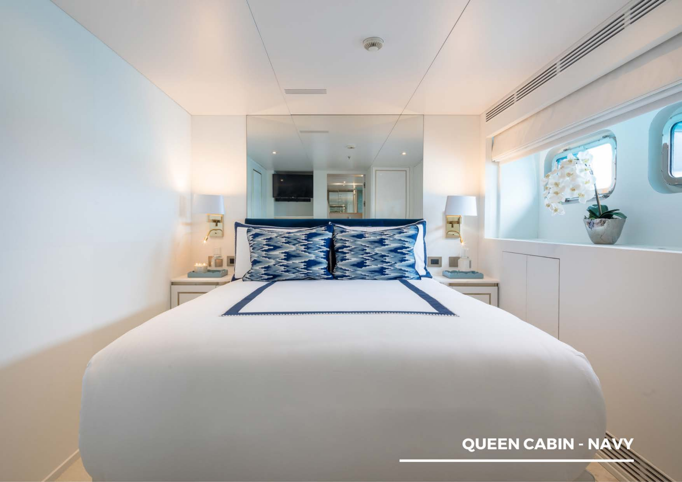
QUEEN CABIN - NAVY