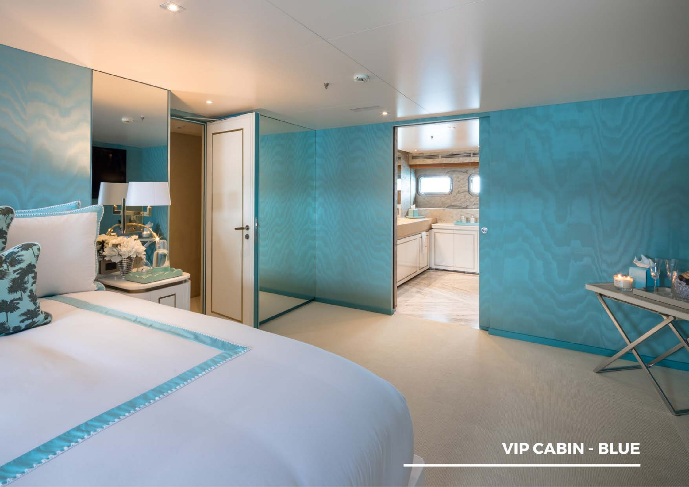
VIP CABIN - BLUE