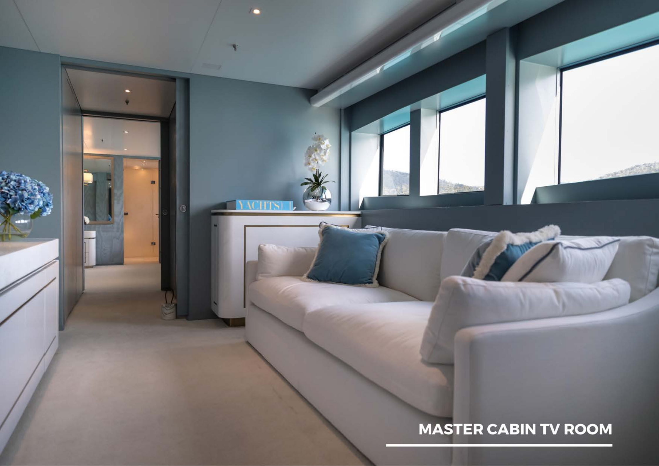
MASTER CABIN TV ROOM