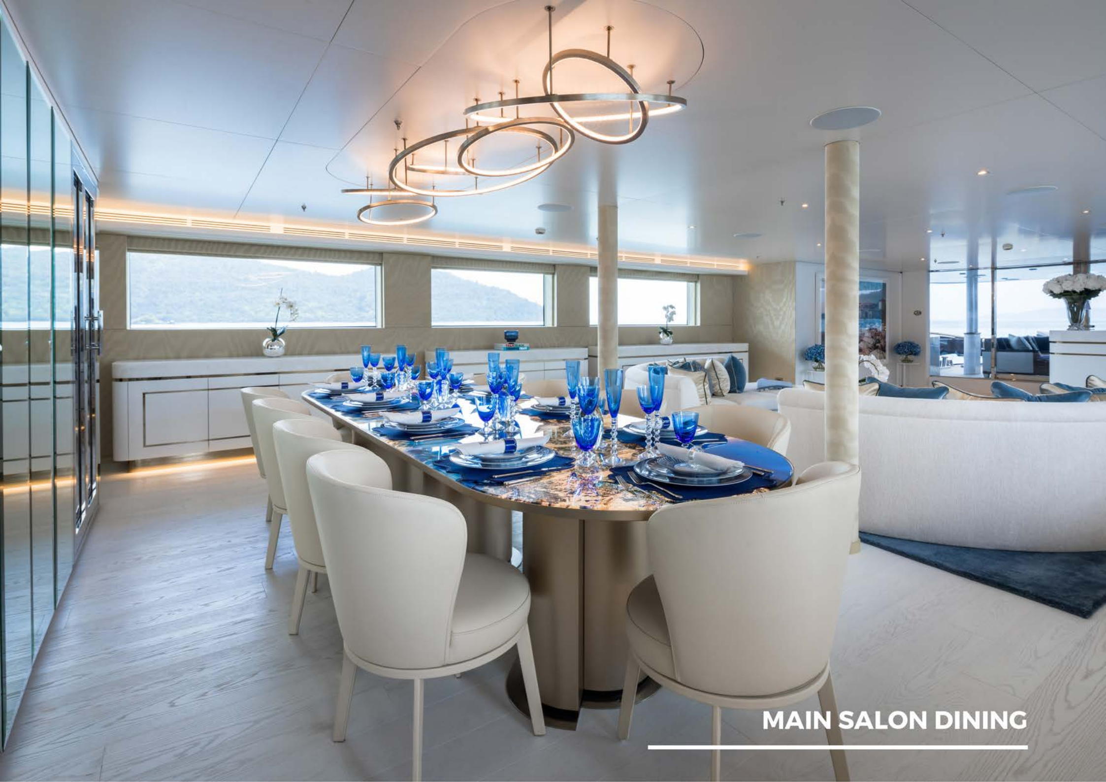
MAIN SALON DINING