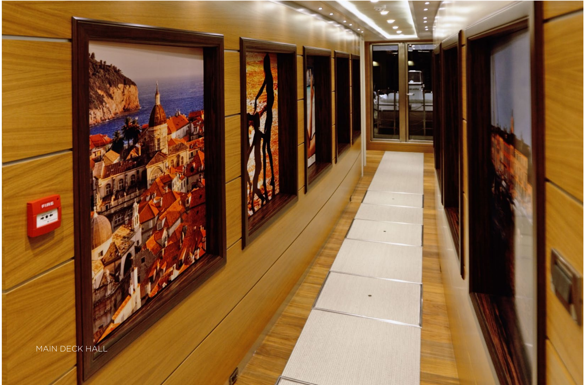
MAIN DECK HALL