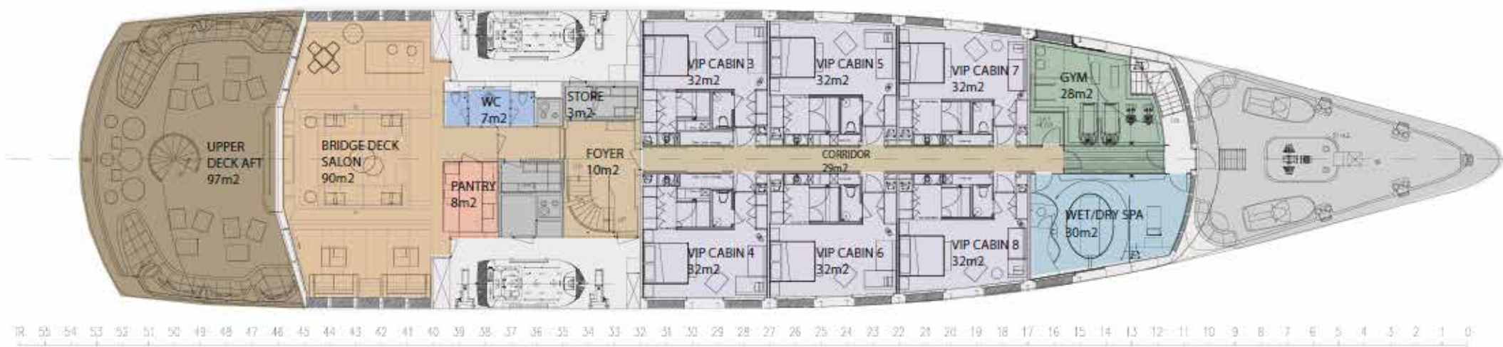
UPPER DECK 494sqm