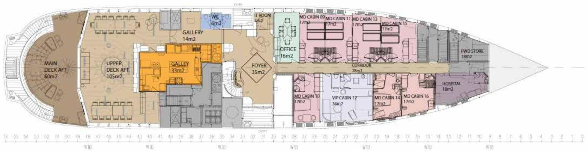
MAIN DECK 490sqm