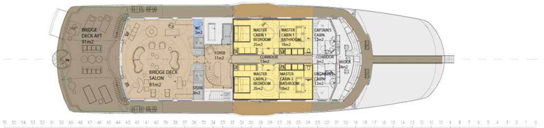
BRIDGE DECK 339sqm