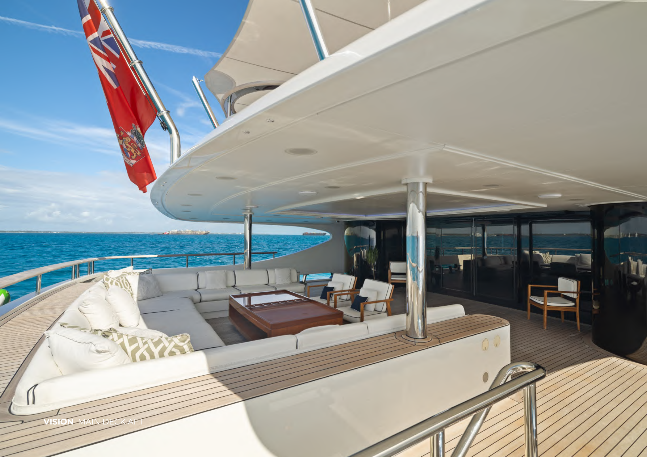
VISION MAIN DECK AFT