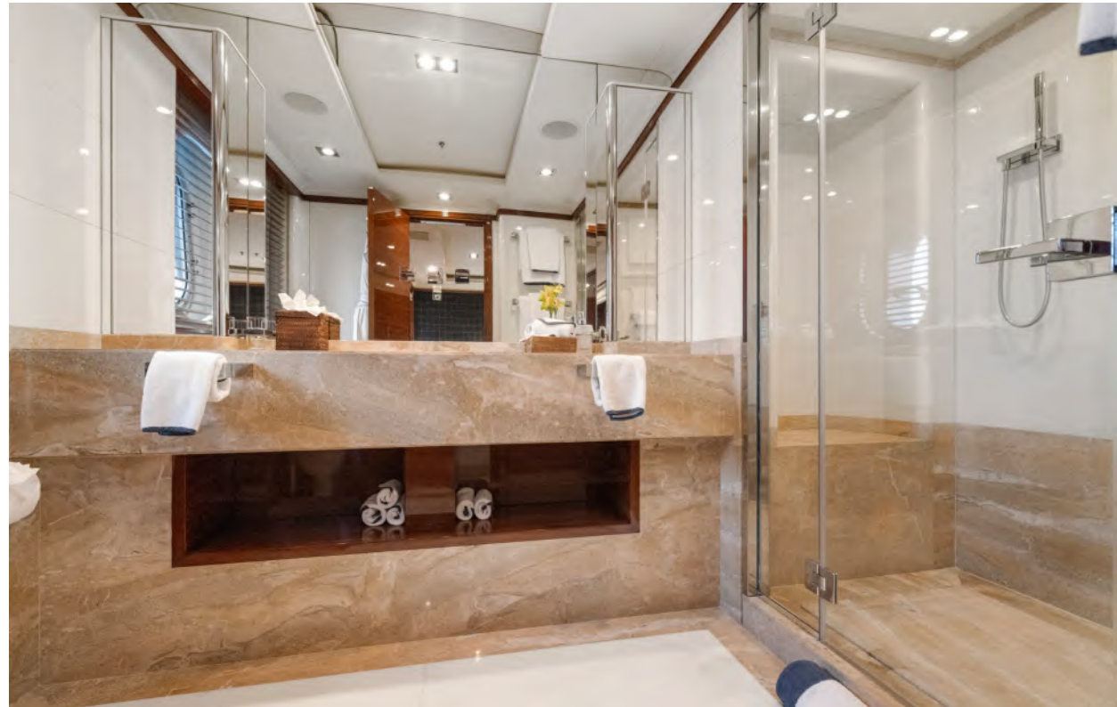
VISION TWIN CABIN