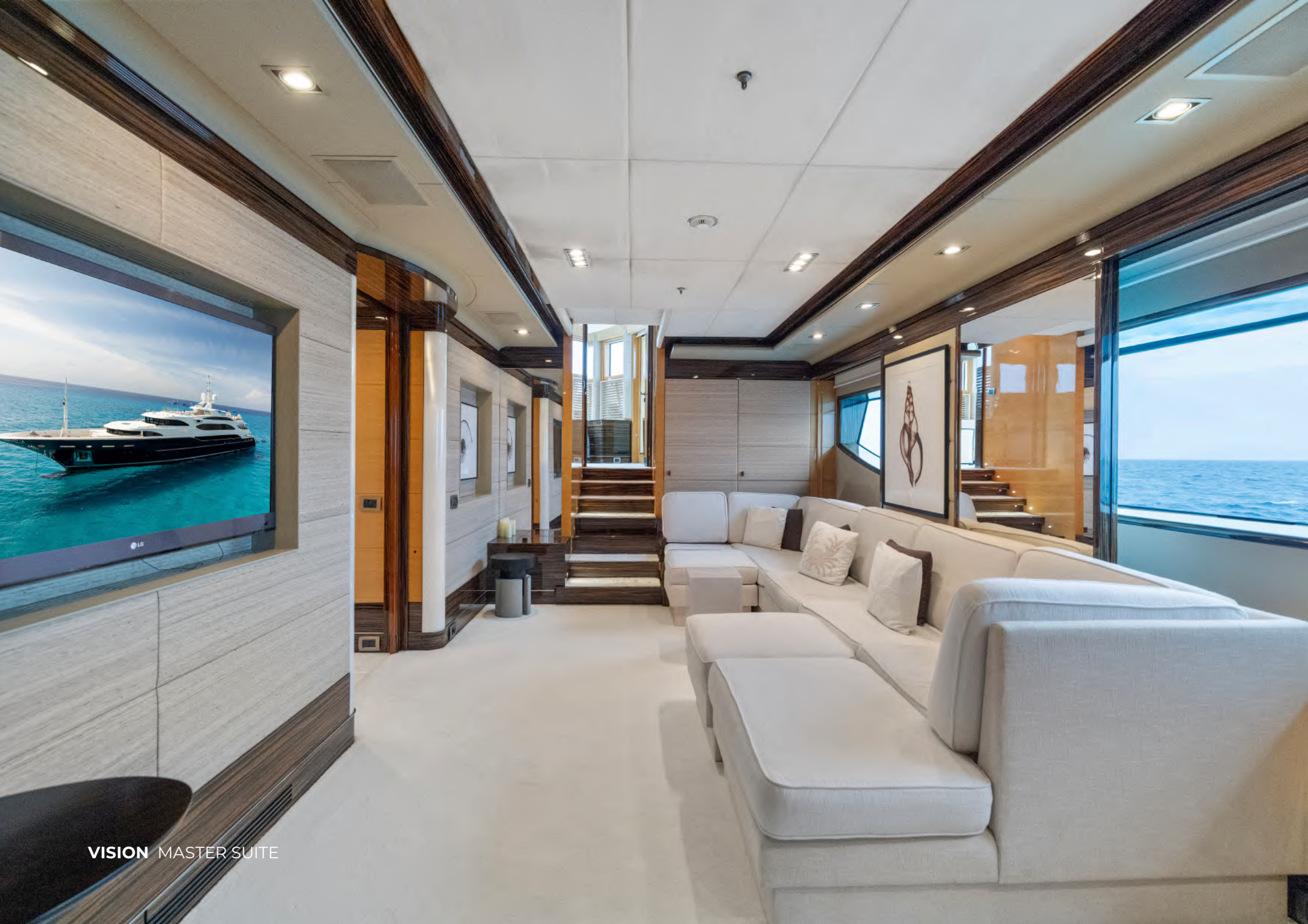
VISION MASTER SUITE