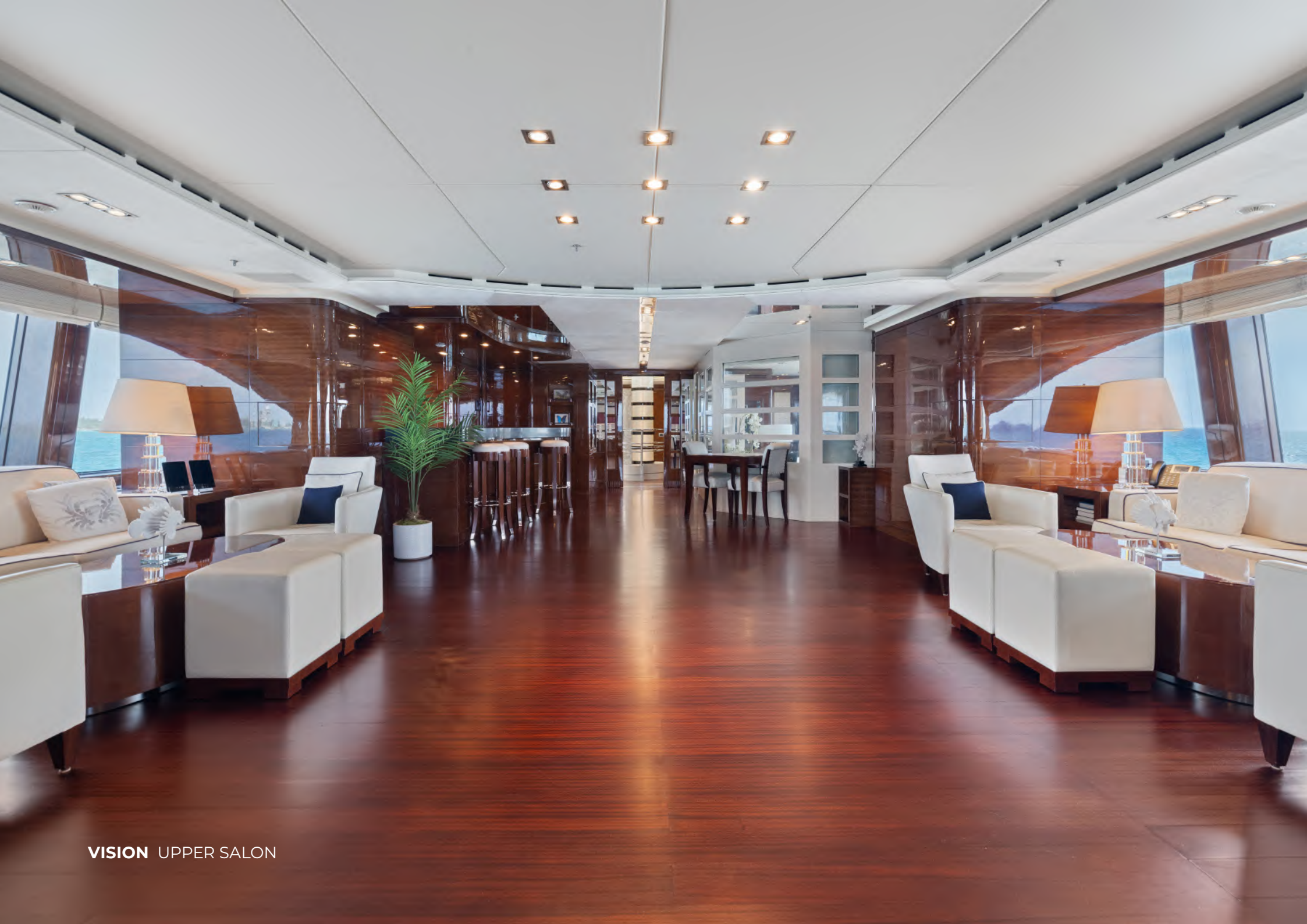
VISION UPPER SALON