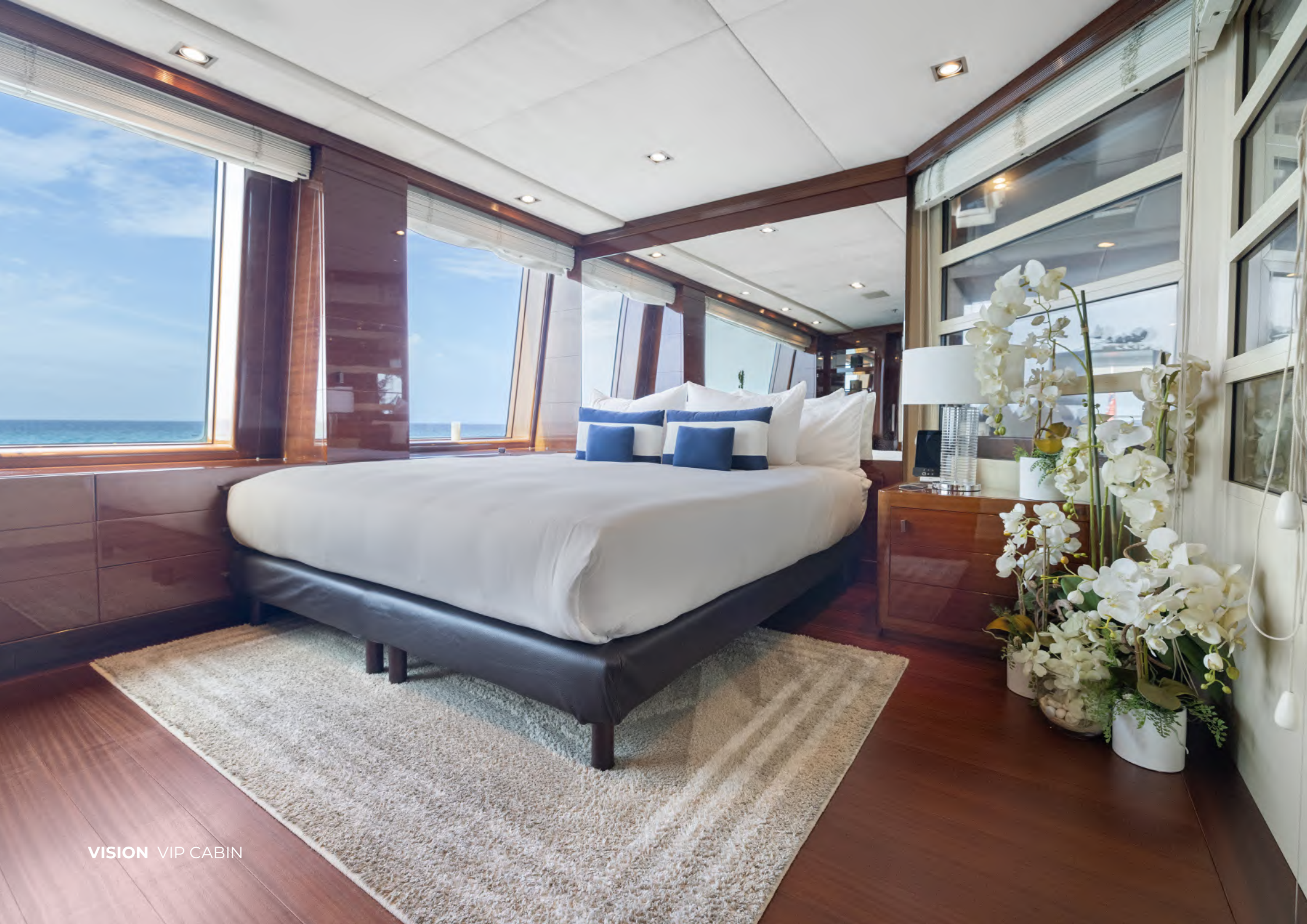
VISION VIP CABIN