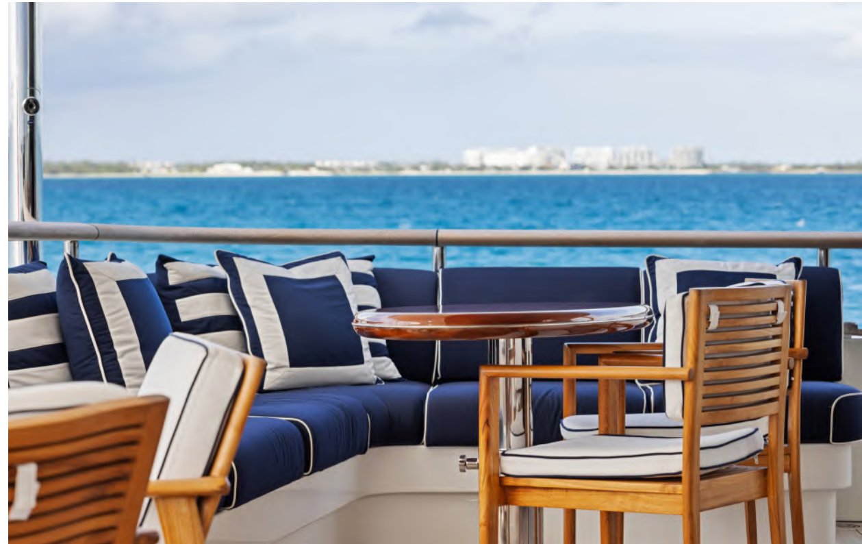
VISION UPPER DECK