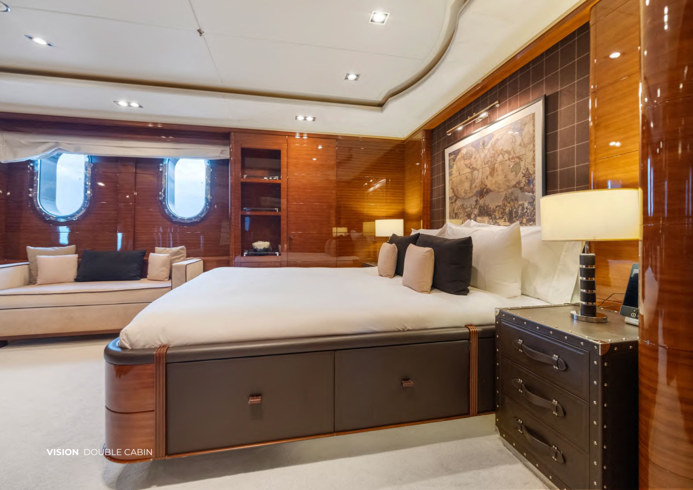
VISION DOUBLE CABIN