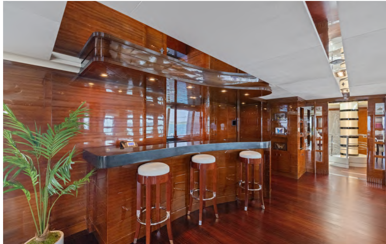
VISION UPPER SALON