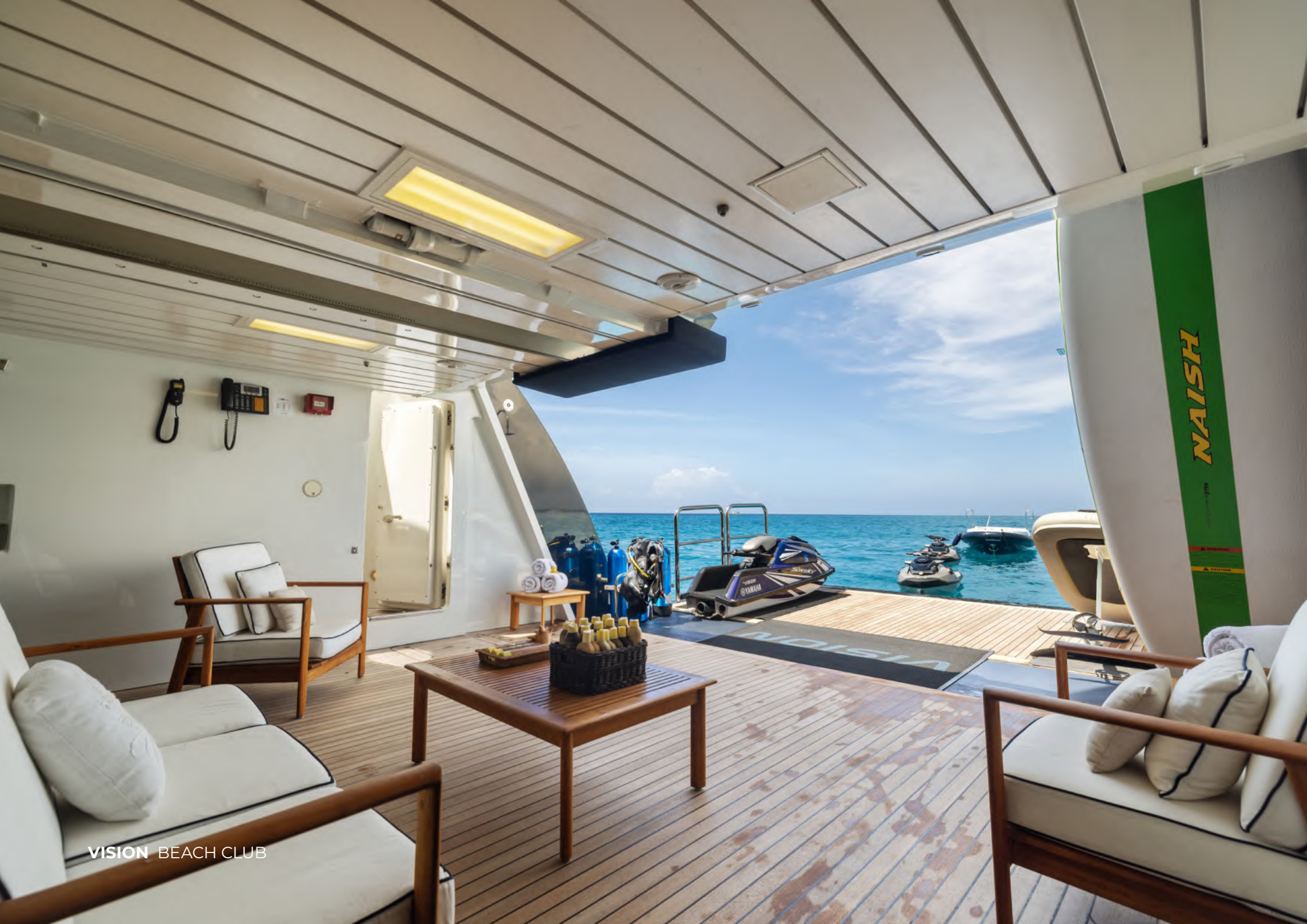
VISION BEACH CLUB