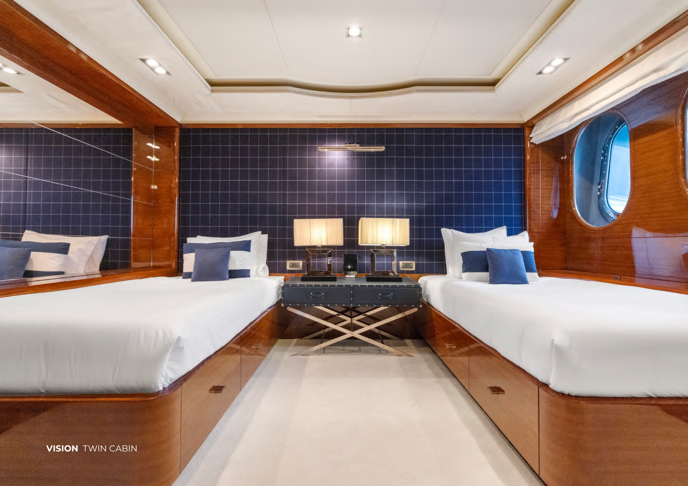
VISION TWIN CABIN