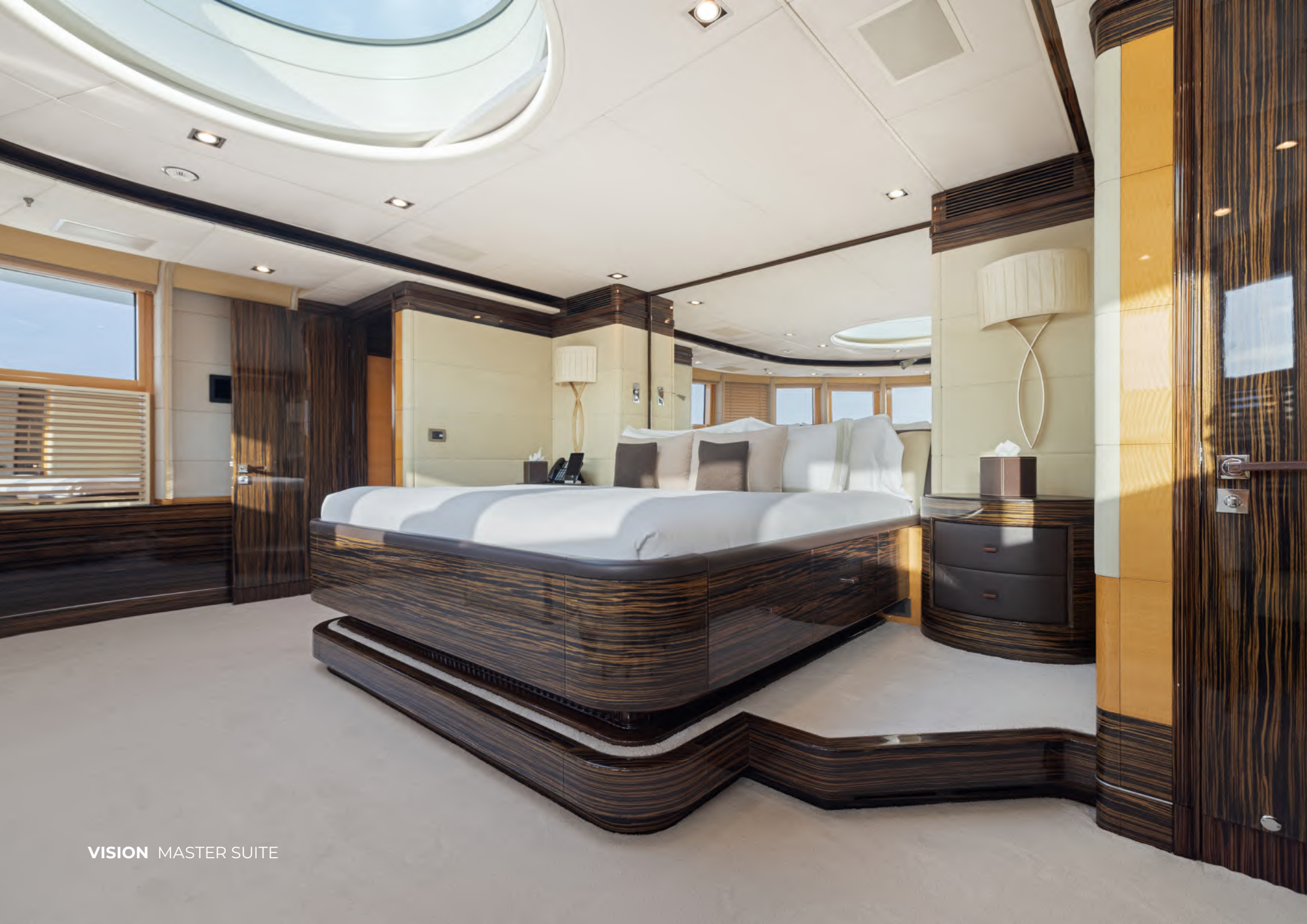
VISION MASTER SUITE