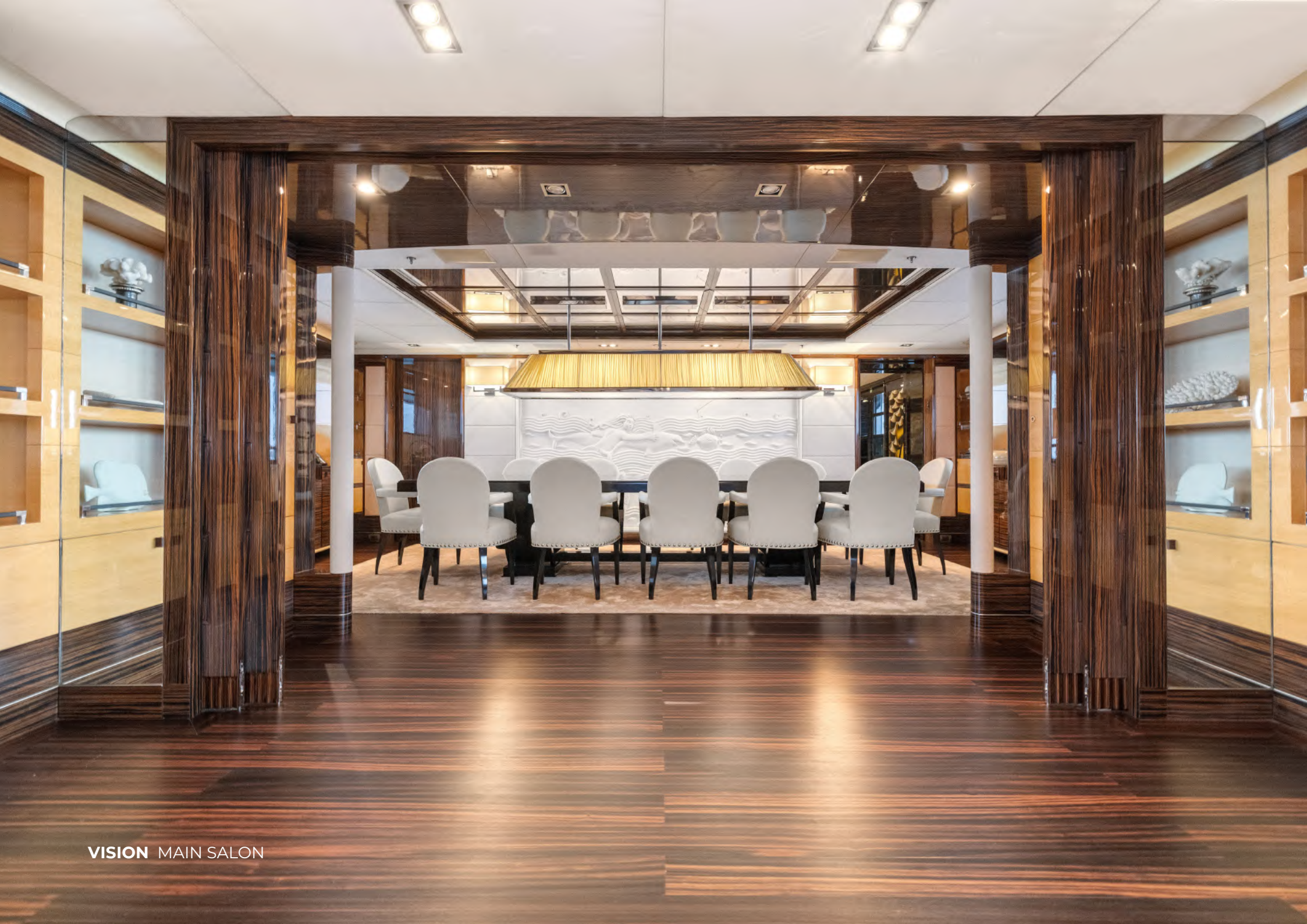
VISION MAIN SALON