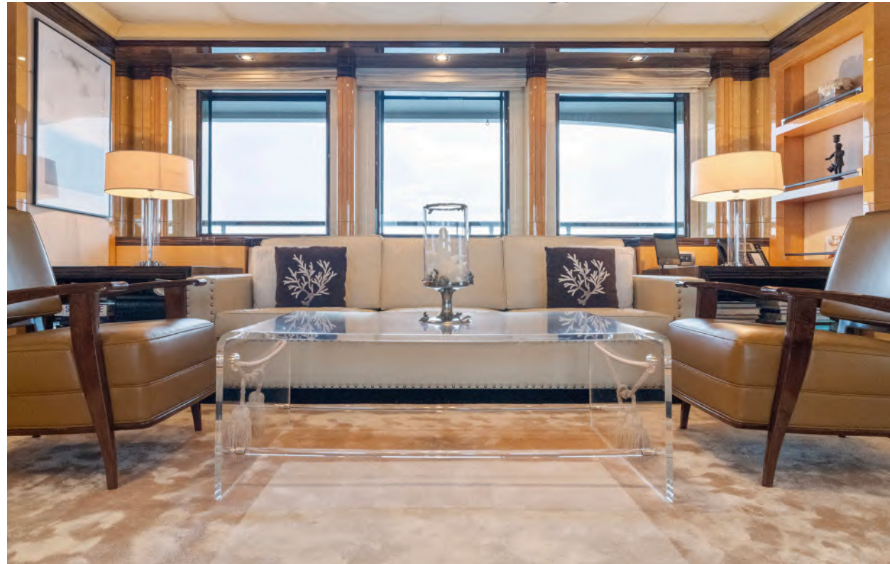
VISION MAIN SALON