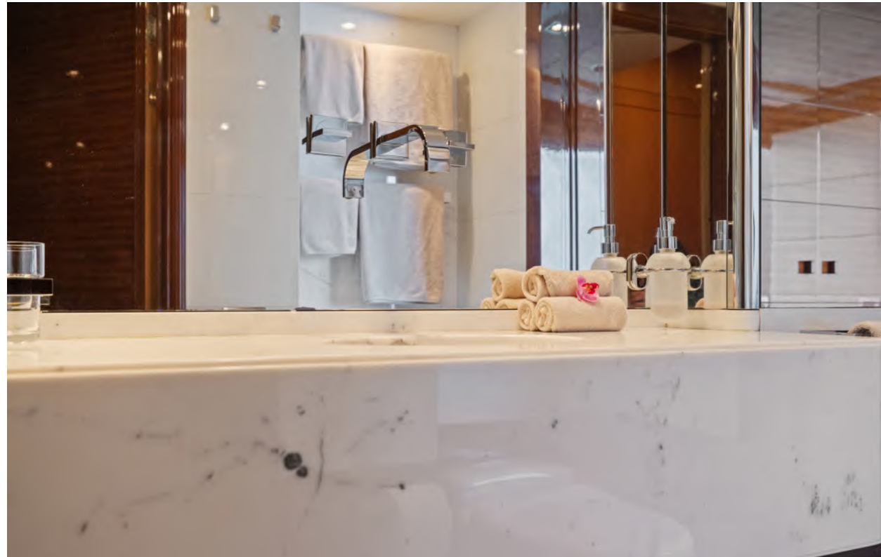
VISION VIP CABIN