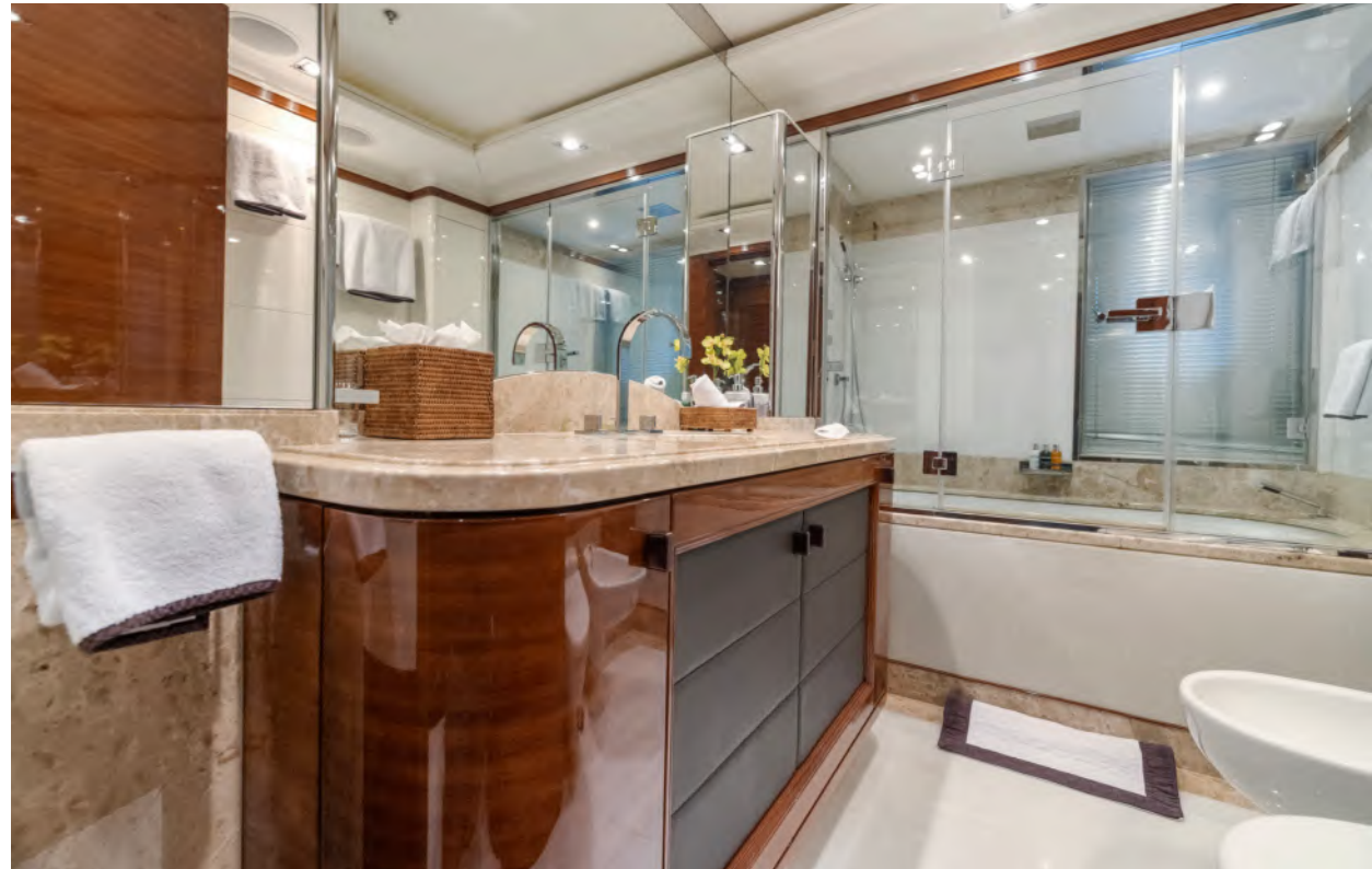
VISION DOUBLE CABIN