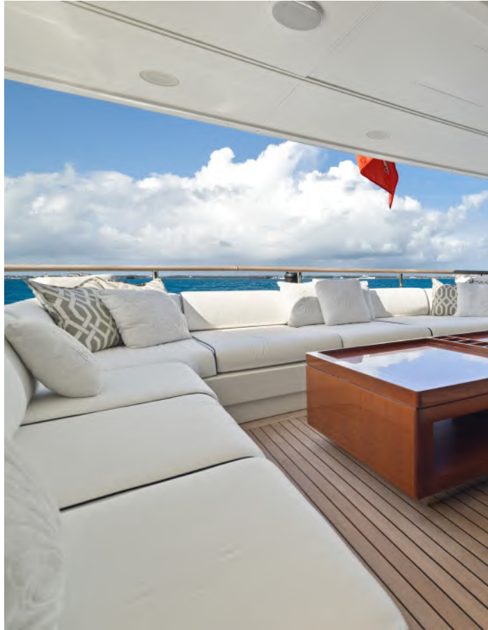
VISION MAIN DECK AFT