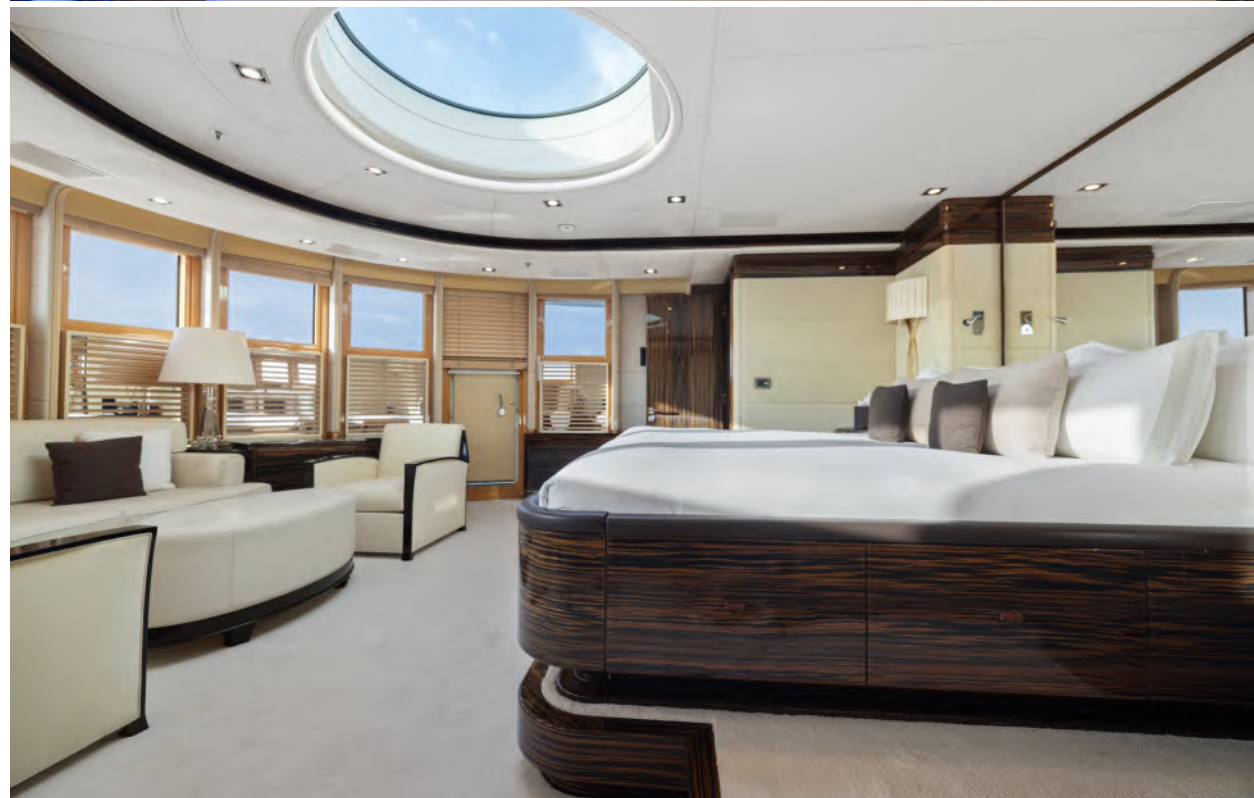
VISION MASTER SUITE