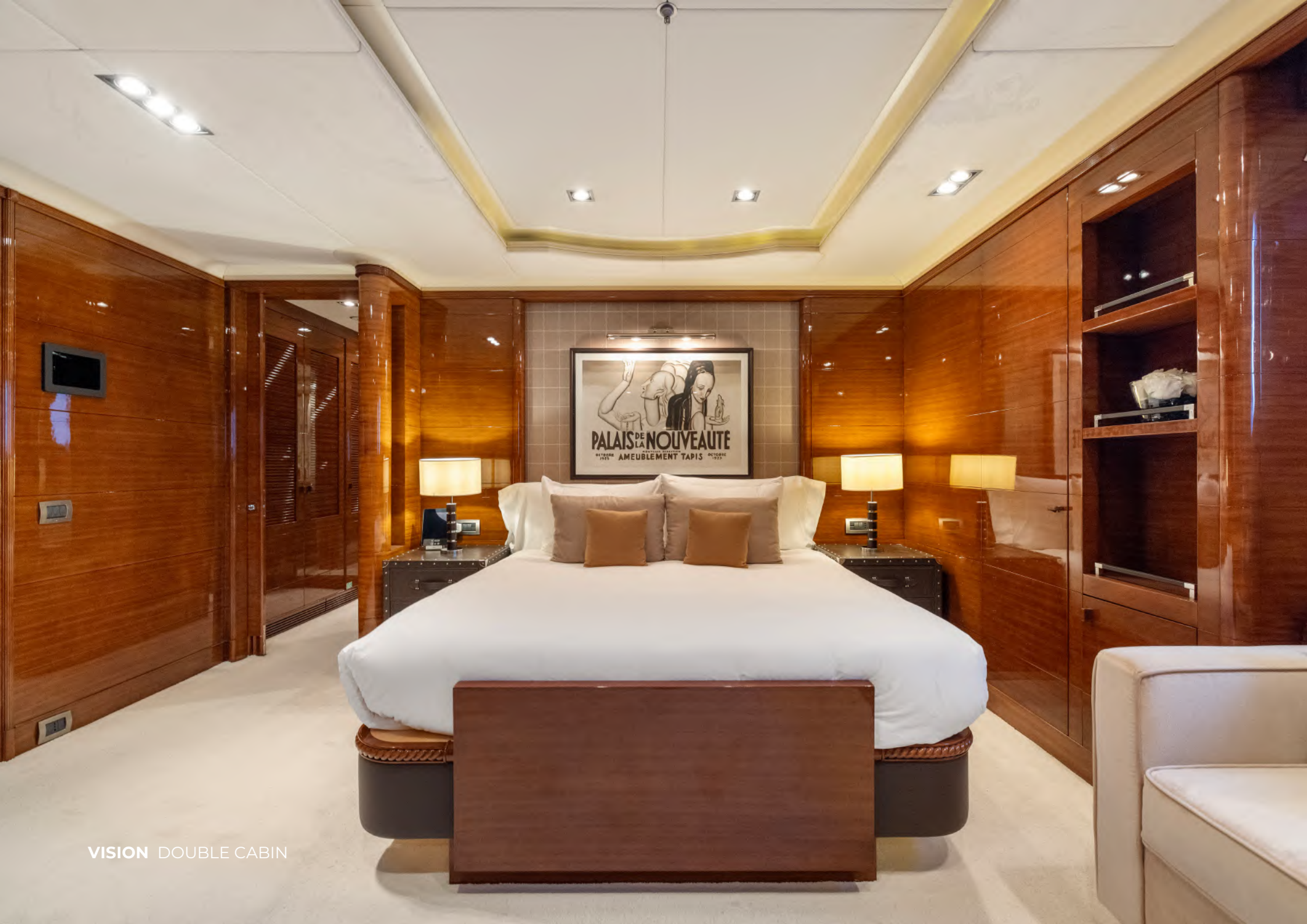
VISION DOUBLE CABIN