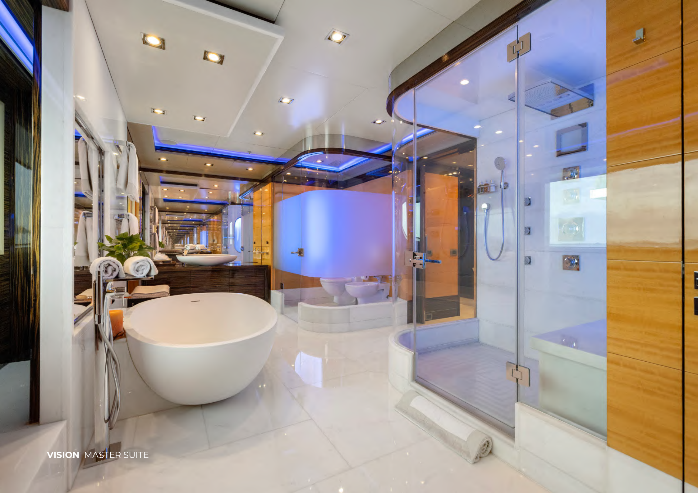
VISION MASTER SUITE